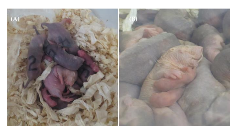
Figure 1. Naked mole-rat colonies huddling together in the nest, with the breeding female lying on the top of the pile. Picture ( A ) shows a small naked mole-rat colony (six non-breeders + queen + her pups) with enough space in the nestbox for the newborn pups to easily crawl around the huddle. Picture ( B ) shows a large colony (60 mole-rats) with the breeding female lactating her pups on the top of the crowded huddle.

offspring [19,63,64]. Naked mole-rats are long-lived, with a maximum recorded lifespan of 37 years [65]. Queens form long-lasting pair bonds with their breeding male(s) and are capable of sustaining reproduction for at least 27 years [66]. After a gestation of 72–77 days [35] the queen gives birth to 12 \pm 5.7 pups (n = 84 litters, 1–29 pups) in the colony nest [28,41], in up to five litters per year [67]. Pups are born blind, with little locomotor activity and are kept warm in the communal nest by other mole-rats (Figure 1) [34,68]. Pups are exclusively nursed by the queen until weaning at ~40 days [28]. One week before they start to eat solid foods, pups begin to beg for caecotrophs from all colony members [34,37]. Naked mole-rats do not exhibit pronounced incest avoidance and may inbreed to a high degree (r = 0.63–0.88) [69,70] although they have a preference for mating with unfamiliar males [71]. Non-breeders usually are close relatives of the queen and her offspring and may, thus, increase their inclusive fitness by staying in the colony throughout their life and helping to rear the offspring [72].