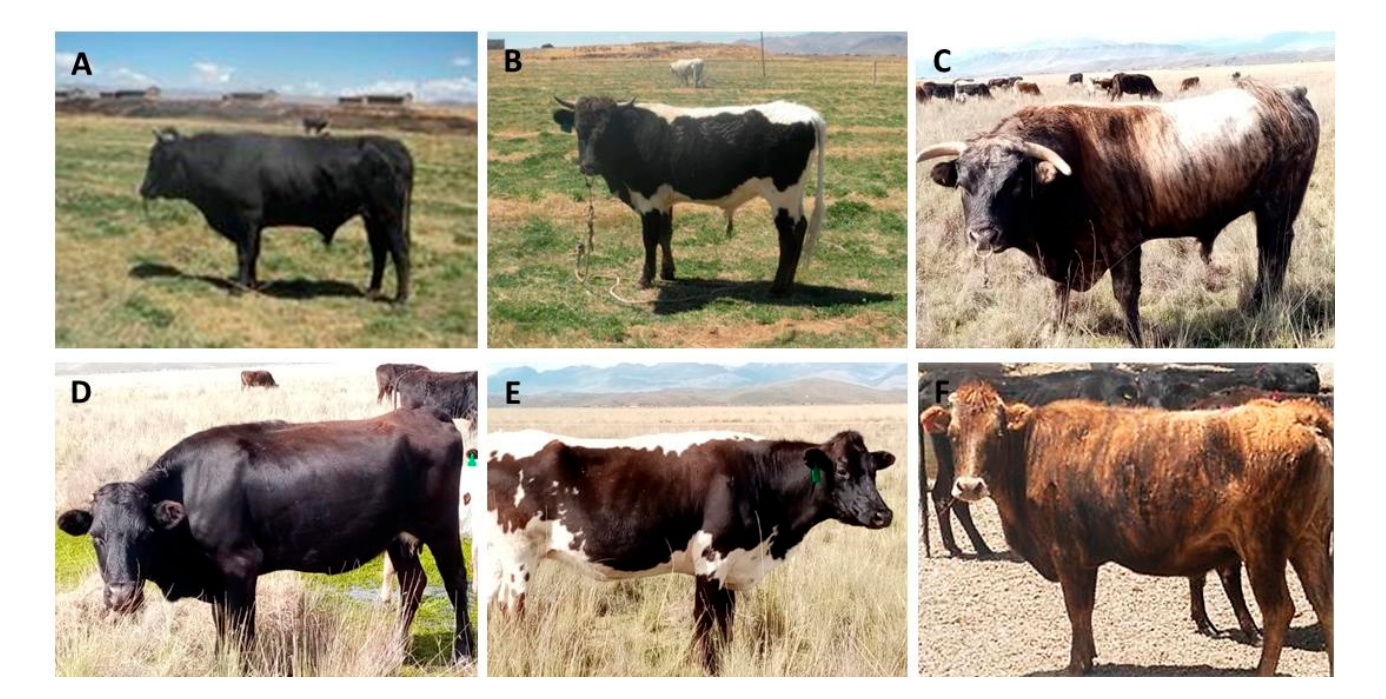
Figure 2. Creole cattle biotypes from the Andean highlands in Peru: ( A , D ) Black 'Negro' biotype male and female, respectively; ( B , E ) Colour-Sided 'Callejón' biotype male and female, respectively; and ( C , F ) Brindle 'Atigrado' biotype male and female, respectively.

and 83 adult females (53 Black 'Negro' biotype, 16 Colour-Sided 'Callejón' biotype, and 14 Brindle 'Atigrado' biotype) were evaluated (Figure 2). The different biotypes have been bred in the Cattle Experimental Research Centre for more than 30 years. The ancestors from all biotypes were originally sourced from different regions (District of Umachiri, Cupi, Llalli, Macari, and Santa Rosa, among others) in the Province of Melgar. The animals had an average weight of 388.10 kg. The age was determined by dentition observation. Animals with 2 to 8 teeth were included in the study. Adult cows were considered when they had at least one calving. The animals evaluated were free of physical defects to avoid alterations in the bio-morphometric measurements.