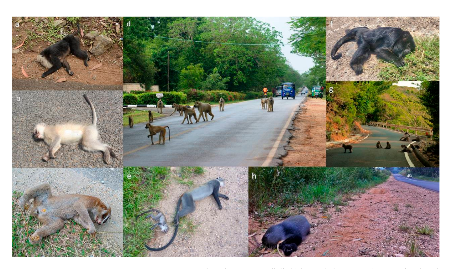
Figure 2. Primates on roads and primate roadkill: (a) lion-tailed macaque ( Macaca silenus ), India (© P. Jeganathan, CC-BY); (b) vervet monkey ( Chlorocebus pygerythrus ), South Africa (© B. Linden); (c) greater slow loris ( Nycticebus coucang ), Malaysia (© N. Yamaguchi); (d) yellow baboon ( Papio cynocephalus ), Kenya (© A. Donaldson); (e) adult female and infant Zanzibar Sykes' monkey ( Cercopithecus mitis albogularis ), Kenya (© A. Donaldson); (f) black and gold howler monkey ( Alouatta caraya ), Argentina (© L. Oklander); (g) Japanese macaques ( M. fuscata ), Japan (© M. Mueller, CC-BY); (h) samango monkey ( Cercopithecus mitis ), South Africa (© B. Linden).