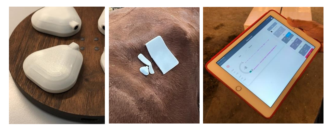
Figure 2. A CURO sensor unit on its charging plate ( left ), positioned on the ruminant at the site of interest ( middle ), generating recordings of rumen sounds in real time to an iPad ( right ).

Figure 1. An example of our own rumen sound recording (Cow #1) made using a CURO MkII wireless system (CURO-Diagnostics ApS, Bagsværd, Denmark) operating Bluetooth 4 and interacting with a recording device remotely. Sampling rate 2 kbps, gain 32 dB. This dataset represents short samples of a longer 34-min recording. Rumen sounds were measured on the decibel (dB) scale. Note the occasional bursts of rumen sounds with relatively long periods of little to no rumen sounds in between them.