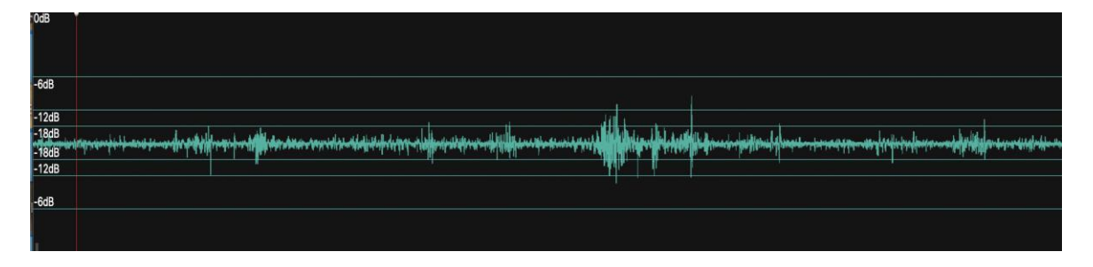
Figure 1. An example of our own rumen sound recording (Cow #1) made using a CURO MkII wireless system (CURO-Diagnostics ApS, Bagsværd, Denmark) operating Bluetooth 4 and interacting with a recording device remotely. Sampling rate 2 kbps, gain 32 dB. This dataset represents short samples of a longer 34-min recording. Rumen sounds were measured on the decibel (dB) scale. Note the occasional bursts of rumen sounds with relatively long periods of little to no rumen sounds in between them.

The sound recordings were made using a CURO MkII unit (CURO-Diagnostics ApS, Bagsværd, Denmark) (Figures 1 and 2). Sound recordings lasted 20 min for each animal and were performed 2 h after the morning meal. Recordings were performed in an open space on-farm. The recording site was prepared with acoustic gel (CURO-Diagnostics ApS), which was thoroughly rubbed into the overlying hair to ensure a good connection with the skin above the rumen, located on the left side of the animal in between the last rib, paralumbar fossa, and lumbar vertebrae. Sensors (piezo ceramic—diameter of 50 mm) were likewise prepared with acoustic gel, before they were attached to the site of interest using flexible self-adhesive bandage (Animal Polster, Snögg Industry AS, Kristiansand, Norway) (Figure 2). The sensors were then connected to the CURO MkII unit and recordings were made in the form of a WAV file to an iPad via a wireless connection (Figure 2), so recordings could be monitored in real-time. Data collection used a sampling frequency of 2000 Hz.