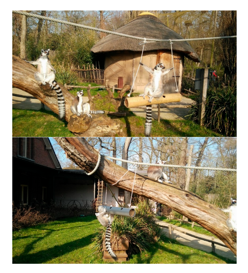
Figure 1. Ring-tailed lemurs interacting with environmental enrichment items: naturalistic looking ( top ) and artificial looking ( bottom ) tube swings.

Any time a food-related item was provided to the lemurs, two or more of the same devices were present to avoid feeding competition [10,17,19]. In these items, a third of the lemurs' daily diet was included to avoid overfeeding. All devices used in this study had been previously offered to the lemurs during another research conducted by our group [35], and were therefore not novel to the animals.