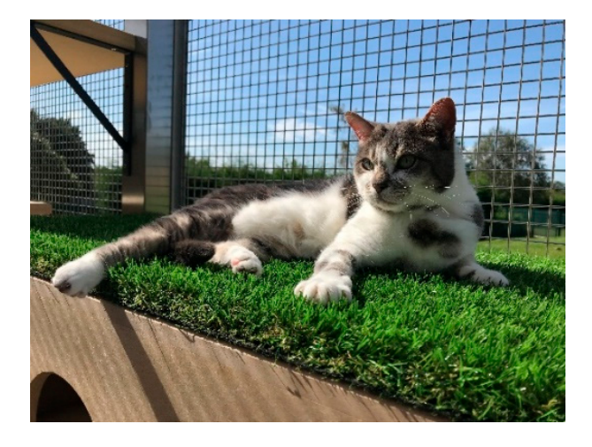
Figure 5. A cat resting on an AstroTurf-covered shelf in the enclosed catio area at Waltham.

Cats housed in research settings may have limited access to external elements, sensory stimulation and exercise opportunities. Additional socialisation areas separate to the housing rooms are provided to add variation in equipment and enrichment activities. Providing cats with safe exposure to outdoor elements is highly enriching for cats, delivering auditory, olfactory and visual sensory stimulation. Outdoor enclosures or secured, mesh windows allow cats to experience sounds, odours and weather and view new activities outside of their living environment [38] (Figure 5).