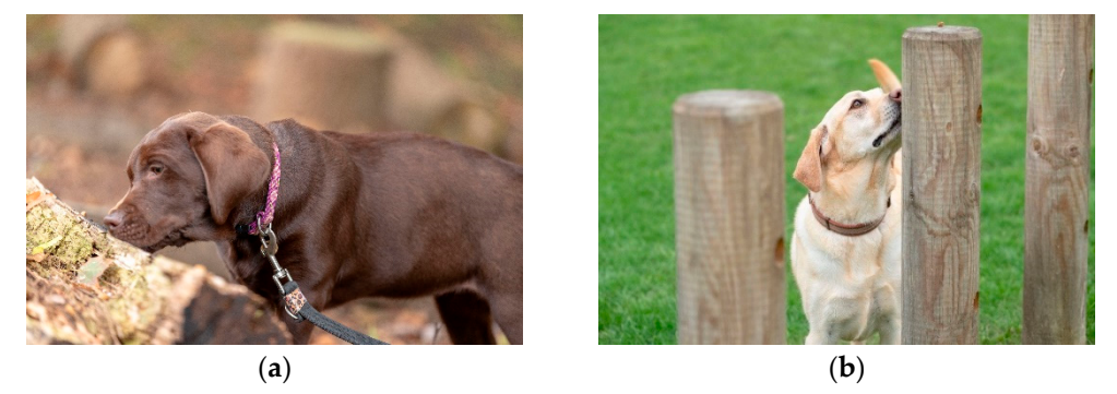
Figure 2. (a) A dog at Waltham having a slow walk through a wooded area. (b) A dog at Waltham experiencing scent play during an outdoor social session.