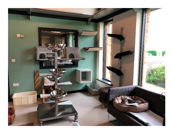
Figure 4. A cat housing room at Waltham showing a stainless steel bowl cat tower and use of walls for enrichment.