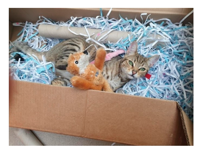
Figure 6. A cat at Waltham enjoying enrichment in a toy-filled cardboard box.

Some cats can find training stimulating, and games such as clicker, nose or paw targeting can be highly engaging [41,42]. Frequently changing or randomising toy presentation can help retain the cat's interest and toy engagement, though some cats choose not to participate in human social interactions and prefer to rest, observe, explore or play by themselves. Having awareness of individual preferences but still providing opportunities and choice for these cat behaviours is essential [43,44]. For example, allowing the cat to choose a novel toy from a selection offered in a box or bag encourages the cat to explore, sniff and search for something they want, activating the seeking system, or they may just choose to play or rest in the box (Figure 6).