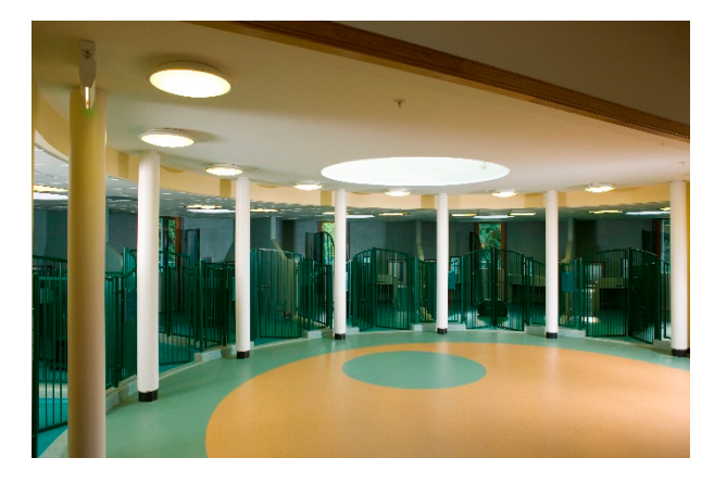
Figure 1. An example of a Waltham dog pod allowing the dogs both visibility and privacy between pens.