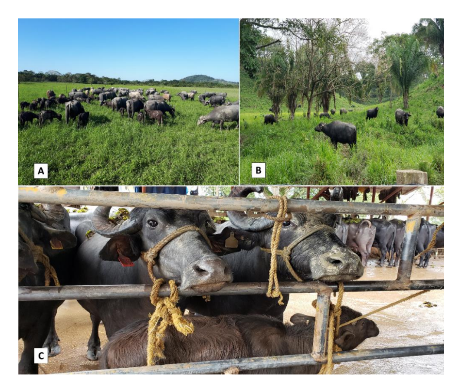
Figure 3. Dual-purpose buffalo production system. ( A , B ) The Latin American humid tropics offer abundant forage resources, including shrubs and trees, to which buffalo are optimally adapted. ( C ) Milking with the presence of calves stimulates milk ejection and favors the development of the calves themselves, which is the basis of a dual purpose.

The availability of the infrastructure and equipment suitable for the objectives of each productive unit is another essential aspect of farms, in terms of guaranteeing the storage and conservation of inputs. Installations should include, for example, shelters for, at least, calves, sick animals and females at the end of gestation. In the case of productive units that include milking operations, it is necessary to provide an adequately conditioned space with suitable equipment and, perhaps, cooling tanks to ensure compliance with the standards of quality and innocuity established for milk and its derivatives that tend to reflect increasing exigencies on the part of clients [40]. Recommendations for production include an inter-parturition interval of 13.8 \pm 1.4 months, with 108 \pm 7.6 open days, an age at first service of approximately 27.27 \pm 1.97 days and first birthing at 37.69 \pm 1.96 months, with the goal of achieving a fertility index around 90% at the end of the reproductive period [38,56].