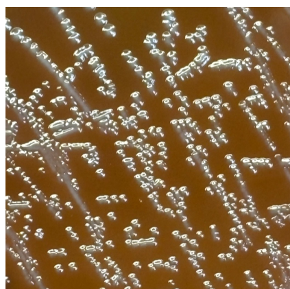
Figure 2. P. bivia colonies grown on a blood agar plate after 72 h. Colonies are shiny and gray in color. Figure courtesy of Sheridan D. George.