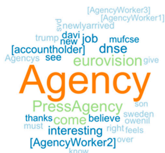
Figure 1. Word cloud of all tweets.

We draw two conclusions from this. Firstly, the DG does not randomly retweet other people's musings, but focuses on sharing links that help to inform/shape public discourse. Our analysis reveals that the DG mainly shares links related to the Agency and to news articles from Sweden's leading newspapers. The following word cloud indicates which words appear most often in all his/her tweets, demonstrating that the associations with ideas and knowledge are far from random. Figure 1 is a word cloud for all tweets. "Agency" is a popular word, along with "PressAgency," but others are private, such as "Eurovision" [Eurovision song contest] and "mufcse" [Manchester United Football Club Sweden].