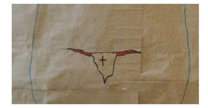
Figure 2. Body map of participant BM2.

One participant described problems with her uterus, which she referred to as a dead area, representing this condition in a drawing of her own body (Figure 2).