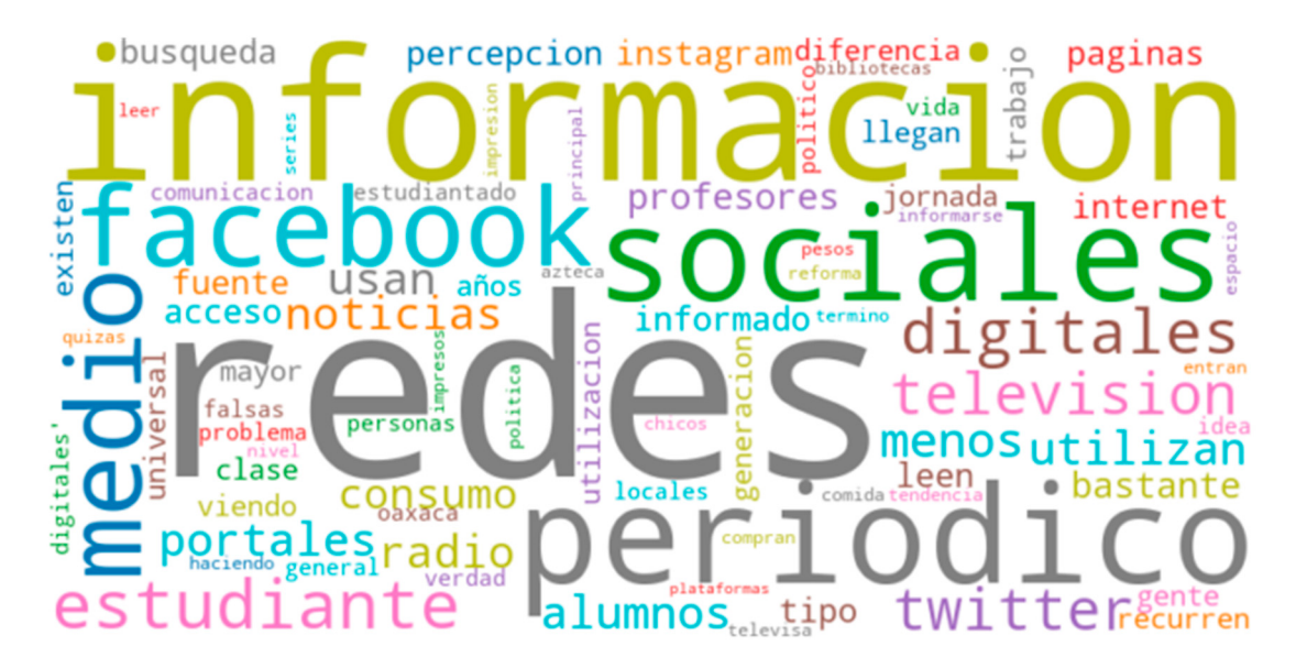
Figure 2. Frequency of words about media consumption.

In order to better analyze the results obtained with the embedding process, it was decided to visualize a couple of specific vectors. In other words, from the selection of two specific words, "consumption" and "trust", it was possible to visualize the words that our algorithm was able to relate. Figure 3 shows the vector space and the words close to the word "consumption".