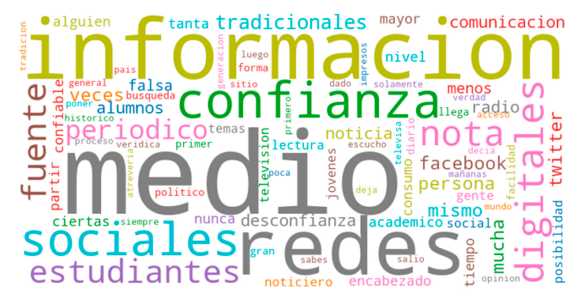
Figure 1. Frequency of words about trust in the media.

social networks. Throughout the interviews, there was a clear consensus among those interviewed that the main sources of information for young university students are social networks. Furthermore, contrary to what the young people say, their teachers perceive that their trust also lies in said media, since some of them mentioned certain episodes in which their students were victims of misinformation.