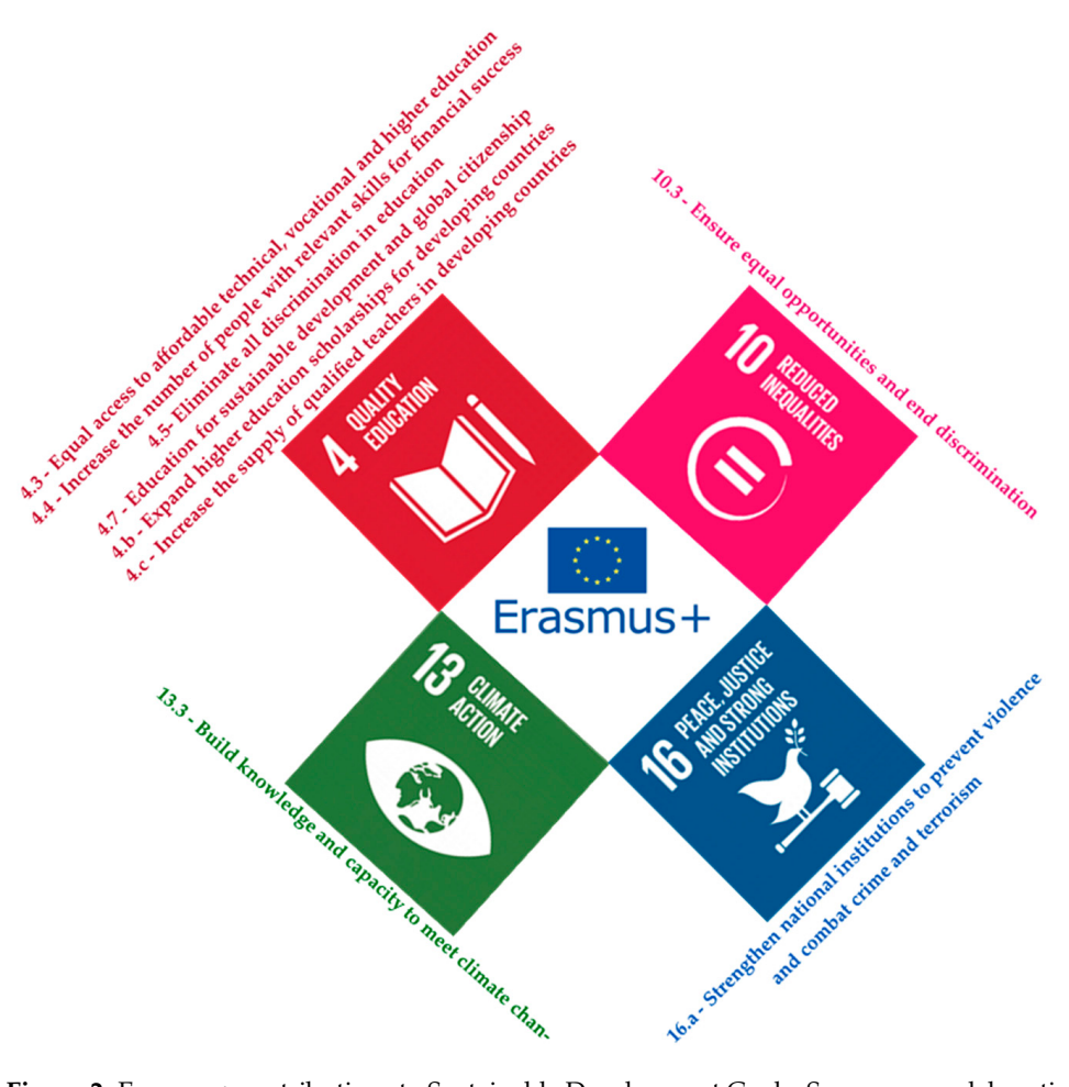
Figure 2. Erasmus+ contributions to Sustainable Development Goals.

4.c By 2030, substantially increase the supply of qualified teachers, including through international cooperation for teacher training in developing countries, especially least developed countries and small island developing States."