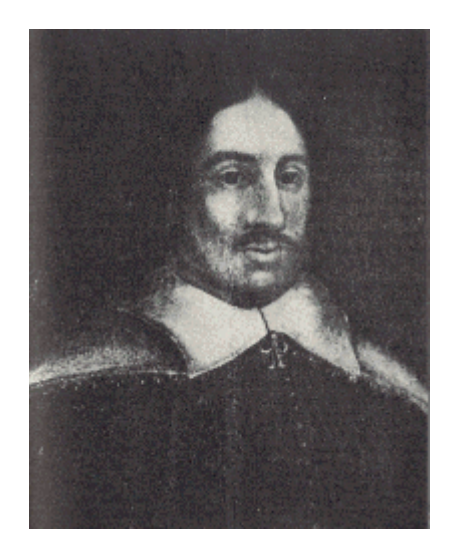
Figure A1. Puritan Settlers (Taken from the Winthrop Society website).