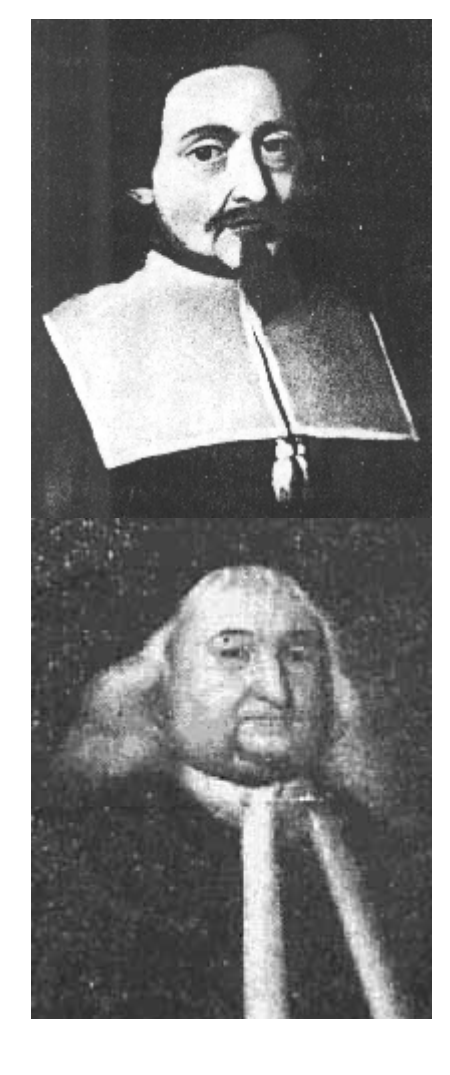
Figure A1. Cont.