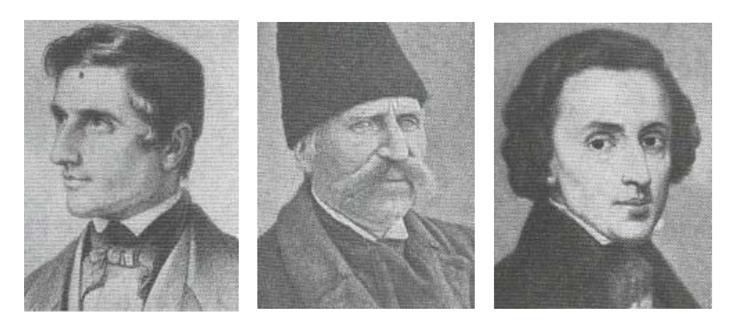
Figure A2. Persons of Dinaric Ancestry.