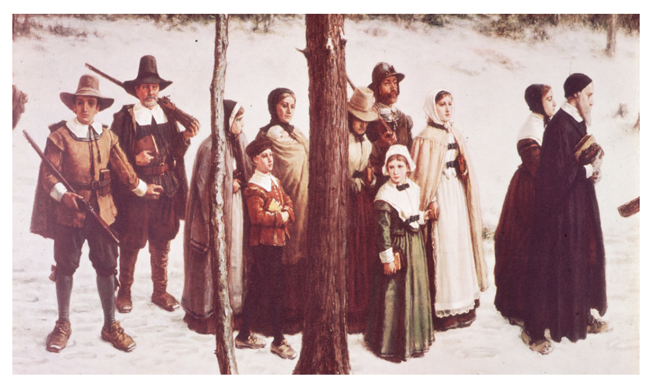
Figure 1. Painting of Puritans on their way to Church.