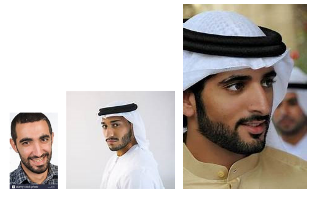
Figure A3. Persons of Middle Eastern Ancestry.