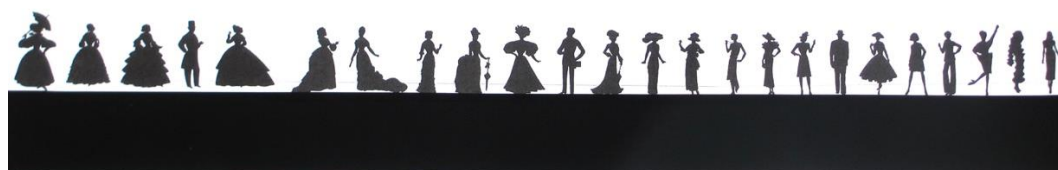
Figure 1. Fashion Timeline (Fashion Silhouettes from 1800–1990). Rachel Matthews 2018. Teaching resource used as a way for fashion students identify evolving womenswear silhouettes.