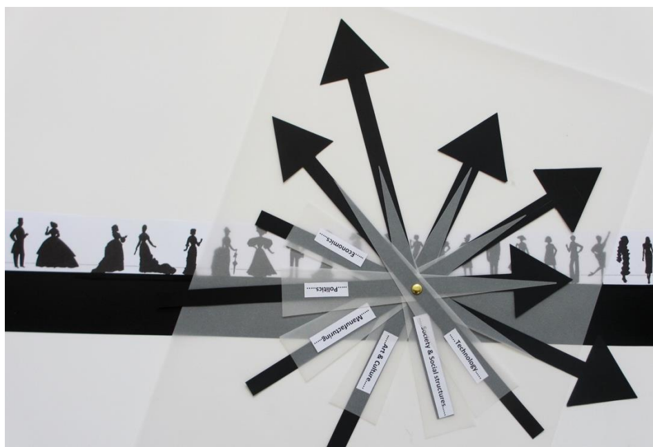
Figure 2. Fashion Timeline meets Assemblage. Rachel Matthews 2018. Example of a visual teaching resource used to introduce students to the notion of change, illustrated on the fashion timeline as a convergence of multiple timelines. The assemblage occurring at the time when these multiple trajectories intersect.

on timing and convergence. The visual structure of the assemblage is not so much a re-drawing of the fashion timeline, rather an over-laying or mapping of other timelines onto its structure. This is a more complex concept than the linear narrative/singular trajectory and a visual device is useful when introducing this idea. Figures 2 and 3 illustrate the learning tools used in this study for explaining the central idea—a moment when multiple timelines or trajectories mapped in different (yet interrelated) fields intersect; their combined impact has the power to change the existing trajectory of fashion.