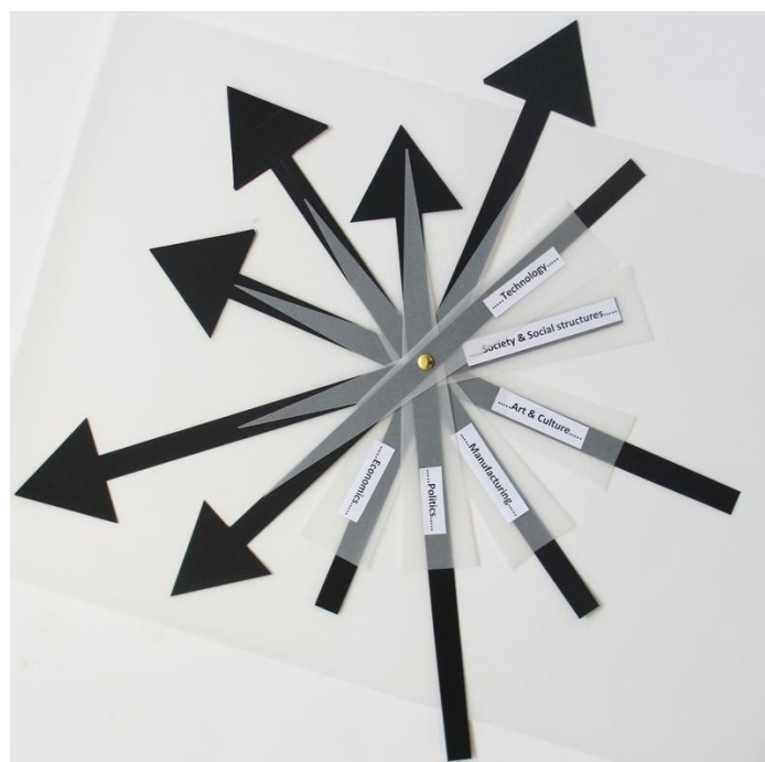
Figure 3. The Assemblage Infrastructure. Rachel Matthews 2018. Example of a teaching resource used to initiate the production of a fashion's history assemblage as a group learning activity.

of change via the assemblage, will always be partial. Despite its limitations, the assemblage opens another discursive construction of fashion's process of change, over time, and draws attention to the possibility of multiple and differing perspectives on historical events. Although implicit in any historical study, what the assemblage does not clearly identify is how our view of fashion's history shifts, as time passes. Our understanding of history and historical events are shaped and influenced by our own position in the present; our perceptions of time are informed by our lived experience. In seeking to find an approach to studying the history of fashion that allows fashion students to draw on their own experiences to advance their understanding, a third visual metaphor has been used to analyse fashion–time–change, the ripple effect.