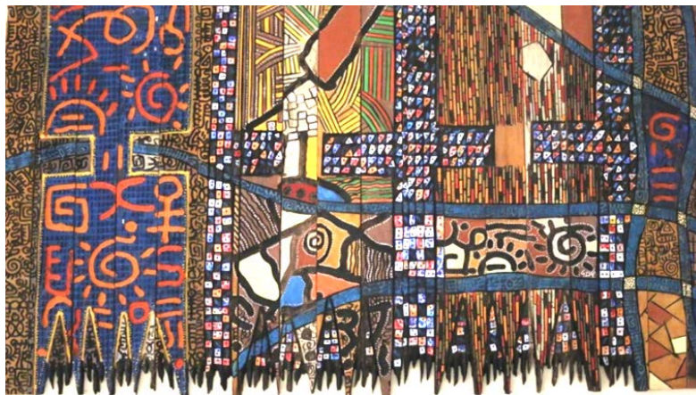
Figure 2. Narrow Way , 2013. Mixed media, 38 × 65". Reproduced with permission from Gerald Chukwuma.

In his creative experiments, Chukwuma turns wooden panels into platforms for engraving and organisation of elements of design. This results in colorful compositions of two-dimensional design and relief (paintaglio). For instance, the Narrow Way (Figure 2) shows the system of design typical of Chukwuma’s several paintaglio experiments. Appearing as an appliqué, Narrow Way reveals indigenous signs, ideograms, and motifs in bright and harmonious tones.