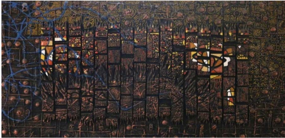
Figure 6. Light out of Darkness , 2013. Mixed media, 48 × 96 × 3". Reproduced with permission from Gerald Chukwuma.

organization, the work shows a highly-pixelated body, saturated with intense visual textures, designed on its border with broken pieces of ropes, round metals, dolls, combs, padlock, and toys or assorted representations of animals and objects.