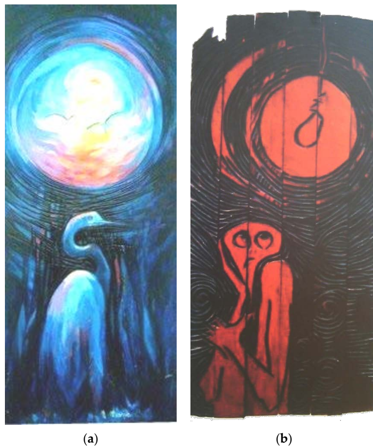
Figure 1. Chijioke Onuora's Paintaglios (a) The Desire to Fly Again , 2003; (b) Hangmen Also Die , 1995. Reproduced with permission from Chijioke Onuora. Photo by the Artist.