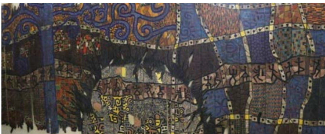
Figure 5. I Know Where the Sun lives , 2013. Mixed media, 71 × 167". Reproduced with permission from Gerald Chukwuma.

order to enjoy a better social and economic life. The common ideology and notion of Africans as constantly in competition and struggle for survival as underscored in Chinua Achebe's Things Fall Apart tends to find expression in Chukwuma's works (Chinua 1958). In I Know Where the Sun Lives , (Figure 5) the artist expresses the concept of self-discovery of individual ability for an adorned future. The Socratic principle "man know thyself" is underscored here to provoke an intensive search into the personality and potentialities of the individual. In a corroborative standpoint, Borgdorff argued that "art's epistemic character resides in its ability to offer the very reflection on who we are, on where we stand" (Borgdorff 2012, p. 154). The reality of identification of knowledge agrees with Chukwuma's views. In I Know Where the Sun Lives , we find representations of the sun, human figures, stylized tree, regular horizontal and vertical lines, uli and nsibidi motifs and other symbols. This is a visual metaphor expressing the open and diverse routes to self-realization, howbeit, to be actualized within the framework of discipline and industry. Chukwuma represents, as central in his work, the imagery of the sun—a figurative expression for the highest point of possibility—and as the nucleus of life, the sun here is personified and perceived as the source of power, light, vision, and that which pushes darkness of ignorance away.