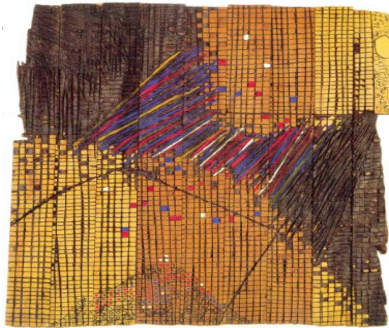
Figure 3. El Anatsui. Earth-Moon Connexions , 1993. Reproduced with permission from El Anatsui.

ideograms together. These indigenous signs and symbols are heterogeneous, having come from different parts of Western Africa. In the 1980s or even earlier, Anatsui's wooden sculptures featured these symbols in form of heavy charred intaglio lines or painted signs. On the instance of use of color, his early 1990s works fashioned with "different power routers, drills, and rotary saws" were also embellished with acrylic and tempera (Okeke-Agulu 2010, p. 41) as can be seen in his Earth-Moon Connections produced in 1993 (Figure 3).