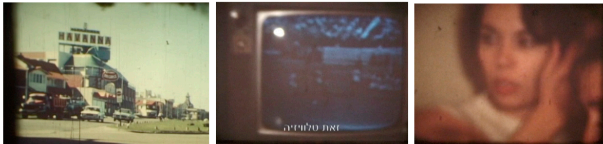
Figure 3. “His/My Memories That Are Not”, Video, 2002.

The second issue (March 2002), devoted to the “Jerusalem Art Scene,” was comprised of the printed issue along with a VHS tape containing seven video works or documentation of performances. 18 The issue also included a video work: 8mm footage by João Delgado, re-edited by Sala-Manca. The name of the video was “His/My Memories That Are Not” (Figure 3). The video features a building in Buenos Aires and a green Ford Falcon, the car used by the military junta in Argentina during the last dictatorship to kidnap/threaten/follow people they considered subversive. Delgado’s voice-over says in Spanish: “This is my house [...] this is a green falcon [...] this is the television [...] a soccer game (addressing the infamous World Cup of 1978 19 ), [...] this is the woman, an ear [...] they are taking it all [...] a gunshot in the navel [...]”. The printed issue included a page of texts and pictures related to the video.