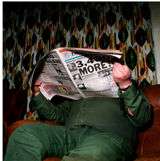
Figure 2. Untitled from the series Pictures from the Real World , David Moore 1987–1988.

In 1985, I was accepted in the BA (Hons) Photography Course at West Surrey College of Art and Design, Farnham, England, where my experiences dovetailed within a reconsideration of my former role through photographic practice. As a series of photographs representing the lives of working-class families on the Osmaston Estate in the City of Derby, Pictures from the Real World , (Moore 2013) was made as my outgoing and final project. The first public view of the work appeared in Creative Camera , an independent photography magazine, within an editorial entitled State of the Art (Moore 1988), and later disseminated within a receptive art-photography discourse of exhibition and publication. Pictures from the Real World was published as a monograph in 2013 and continues to be widely exhibited, collected and published. See Figure 2.