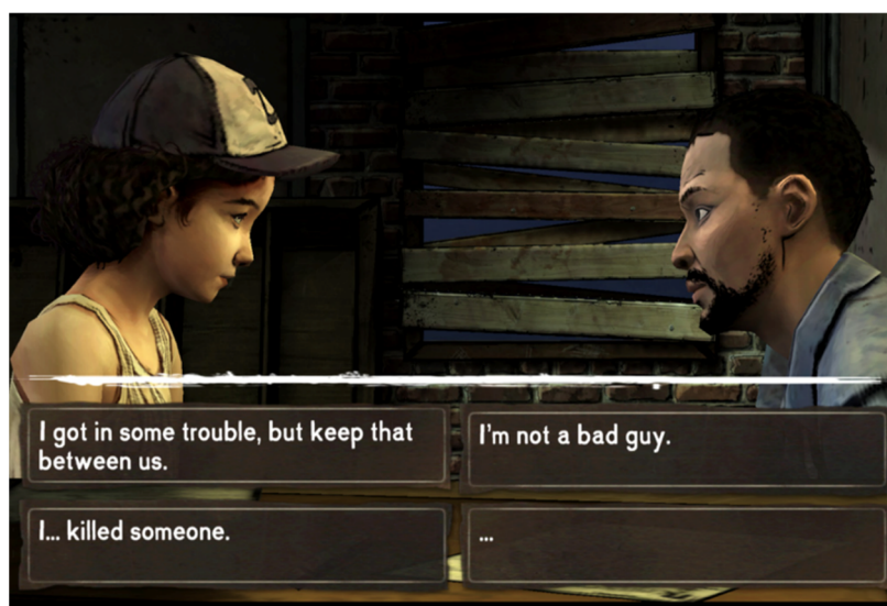
Figure 2. Dialog choices for the player-character, Lee (right), in conversation with Clementine (left), including the silent option (indicated by the ellipsis in lower right) and white timer bar in Telltale Games' The Walking Dead .