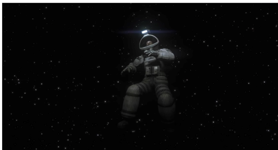
Figure 6. Amanda Ripley receding into empty space at the end of Alien: Isolation .

The game's last Alien, however, is defeated in a scene involving no cooperation with other characters, and with only minimal interactivity. We, as Amanda, have managed to escape the space station and get aboard the Torrens again, and the Alien comes after us in a quick time event: after we hit a button which opens the airlock, the scene fades to black. The next thing we see is Amanda in space (in a cutscene)—apparently, she was ejected from the ship along with the Alien, which is nowhere to be seen. The game ends with Amanda floating off into empty space (Figure 6)—expressionless, emotionless, and alone.