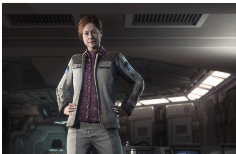
Figure 4. Potential mother figure, Captain Diane Verlaine, of the transport vessel Torrens .

The writers of Alien: Isolation begin with an attempt at developing characters that players care about: the game begins, after all, with a fairly promising (though truncated) cutscene which sets up a potential character arc for Amanda as a woman who will gain closure, or healing from the grief caused by the loss of her mother. The writers could have then taken another step in that direction by offering a new mother figure in the self-assured Captain Diane Verlaine (see Figure 4), whose ship takes Amanda and Samuels to Sevastopol Station.