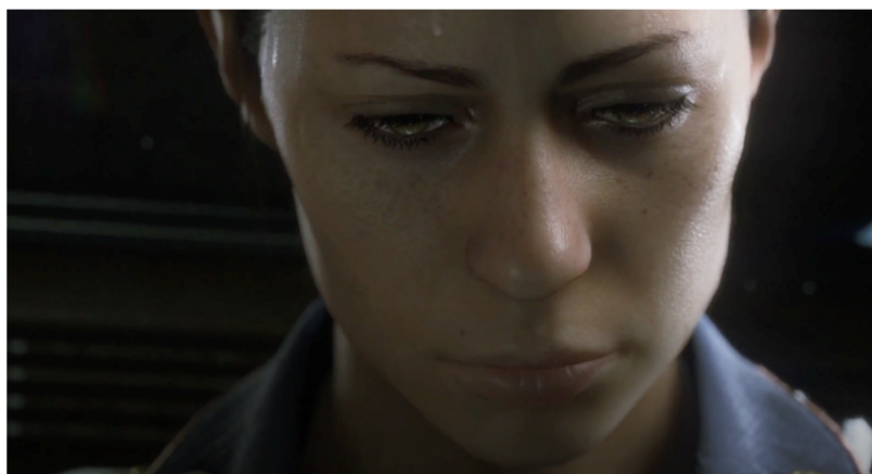
Figure 1. Amanda Ripley's face expresses empathy-inducing grief as Samuels says, "Maybe there'll be some closure for you."

her expression, and our hearts go out to her 1 —literally, in fact, since as we take in her grief-stricken expression (see Figure 1), the sound of a beating heart slowly rises in the background, getting faster. This subtle audio cue heightens our sense of vicarious grief and also of excitement as the adventure begins.