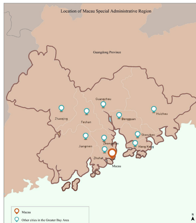
Figure 1. Geographical location (adapted from the draft Macao Urban Master Plan).

Macau is one of the Special Administrative Regions of the People's Republic of China (Figure 1), located on the northern coast of the South China Sea and to the west of the Pearl River Estuary [48]. Macau became part of the territory of the Qin Dynasty after Emperor Qin Shi Huang's three expeditions to Lingnan. In 1557, Macau was leased to the Kingdom of Portugal, and on 20 December 1999, the political sovereignty of Macau was returned to China. This historical journey has spanned over four hundred years [49]. On 15 July 2005, 22 buildings, 8 squares, and piazzas in the historical city of Macau were inscribed on the UNESCO World Heritage List [50]. Macau has a unique historical background, bringing together cultures from China, Portugal, India, Africa, Southeast Asia, and more, creating a rare fusion of Eastern and Western cuisine, architecture, and cultural landscapes.