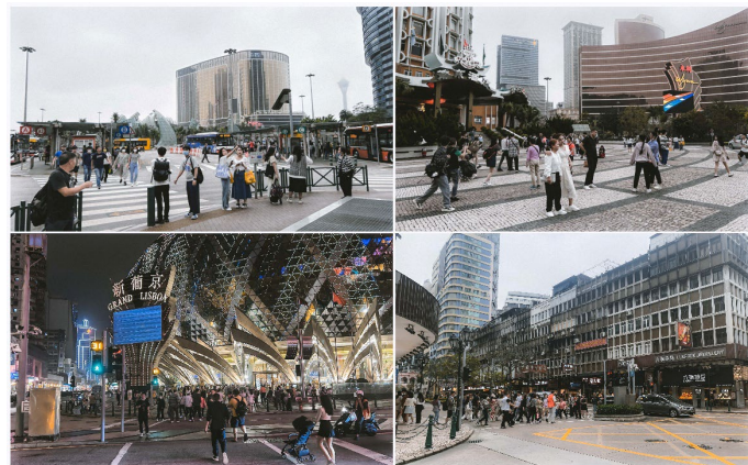
Figure 3. Scenes of tourists in the urban space of Macau.