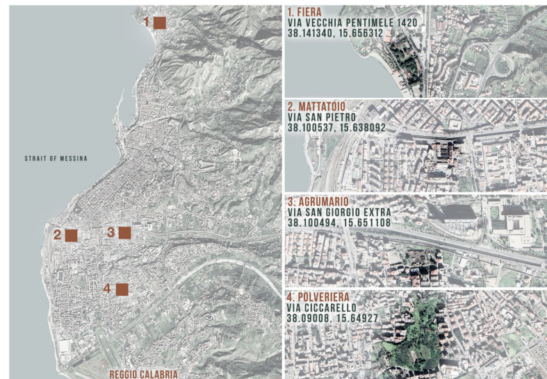
Figure 1. Case studies of industrial heritage in vulnerable contexts. (1. Fiera; 2. Mattatoio; 3. Agrumario; 4. Polveriera).

industrial activities in different sectors that were of significant importance in Reggio Calabria's past but had been abandoned by the mid-twentieth century, shifting from being resources to problems to be addressed.