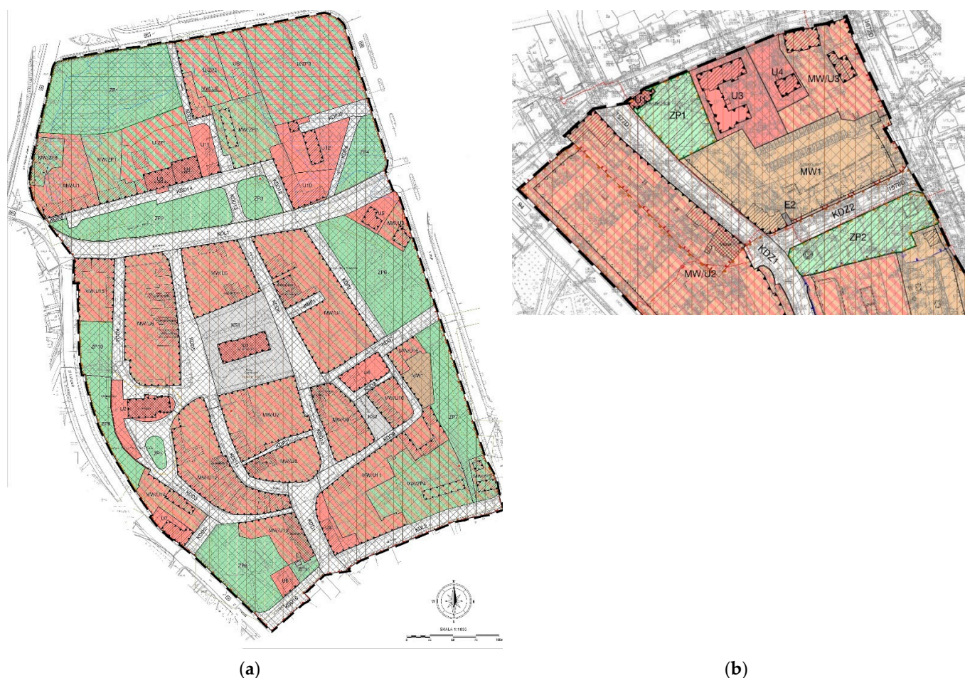
Figure 1. Arrangements of the local plan: (a,b) leaving the squares areas without the possibility of building development, maintaining the ring system of greenery in the city centre. The arrangements of the neighbouring areas include the function of greenery arranged for basic purpose, on par with the areas of multi-family housing and service buildings. Source: [27].

In addition, it was pointed out that all undeveloped and unpaved areas should be used for various forms of greenery. These provisions are essential to prevent/protect against the possible fragmentation of green spaces and allow for the formation of an appropriate climate in built-up areas. It is noted that compensation for biologically active areas should be sought to the greatest extent possible.