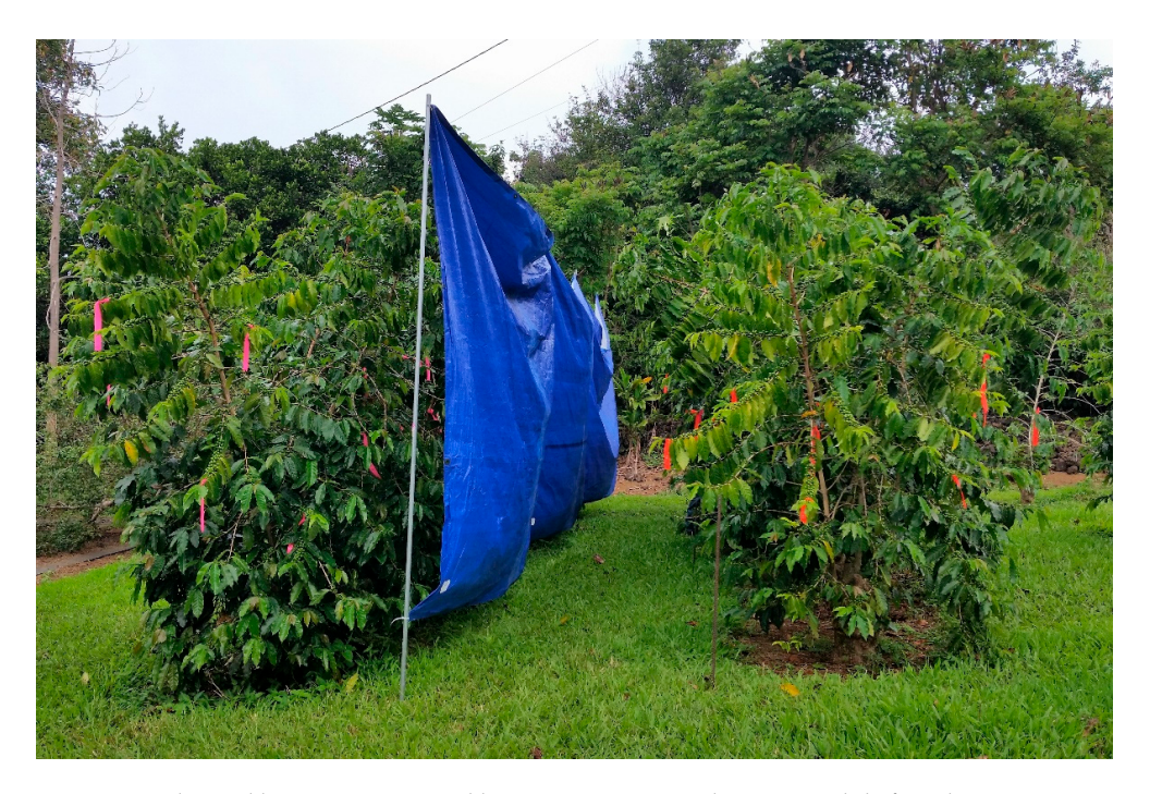
Figure 3. A physical barrier was erected between treatment plots to avoid drift and cross-contamination. These barriers were removed following the spray applications.

Figure 2. Coffee berries were marked with oil-based pens of different colors to identify initial and new infestations by coffee berry borers during the trial. Marks were placed away from the entry holes.