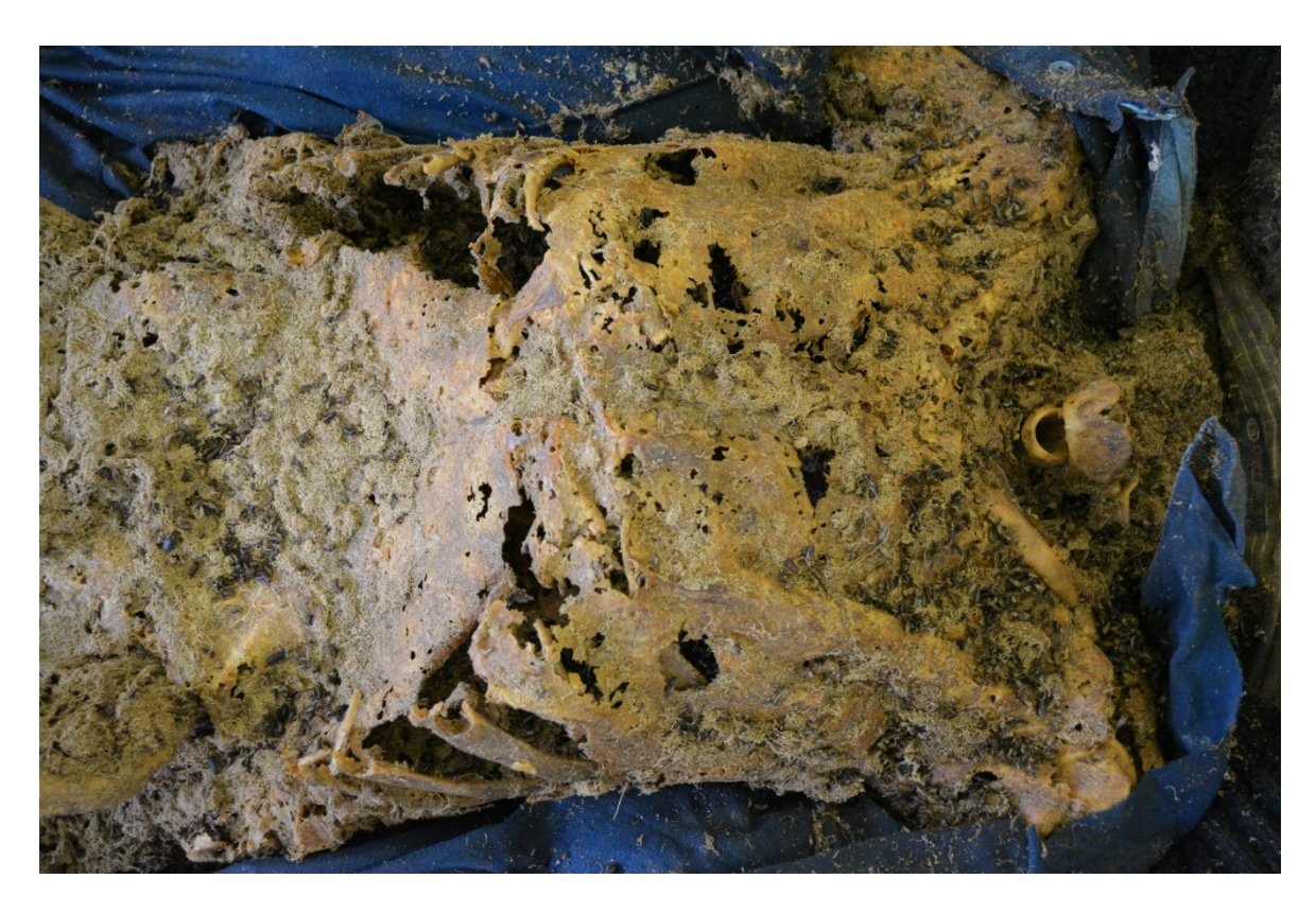
Figure 2. Feeding marks of Dermestes sp. (Coleoptera: Dermestidae) on the trunk of the cadaver (case, #1).