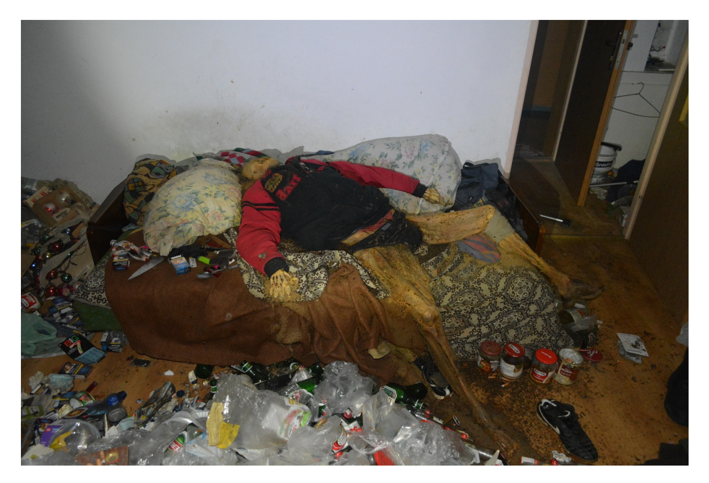
Figure 4. View of the corpse at the scene of its discovery (case #2).

In terms of insects found on the corpse, adults and larvae of D . ( s.str. ) haemorrhoidalis (hundreds of individuals) were collected and preserved. In this case, the forensic entomologist was not present at the site where the body was found.