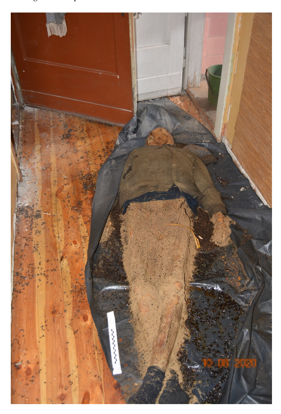
Figure 1. View of the corpse at the scene of its discovery (case #1).

with uneven, jagged, brittle and yellow-coloured edges filled with entomological material (evidence of beetle feeding). Moreover, the following findings were made: degenerative changes in the joints of the left wrist; degenerative and proliferative changes of the lumbar spine in the form of osteophytes; a healed fracture with displacement of the proximal epiphysis of the right humerus; sequelae of traumatic injury of the right shoulder joint with deformation of the clavicle and scapula; a healed fracture of the proximal epiphysis of the left tibia with the presence of an orthopaedic plate; and a healed fracture of the fifth bone of the right metacarpus. The cause of death was not determined.