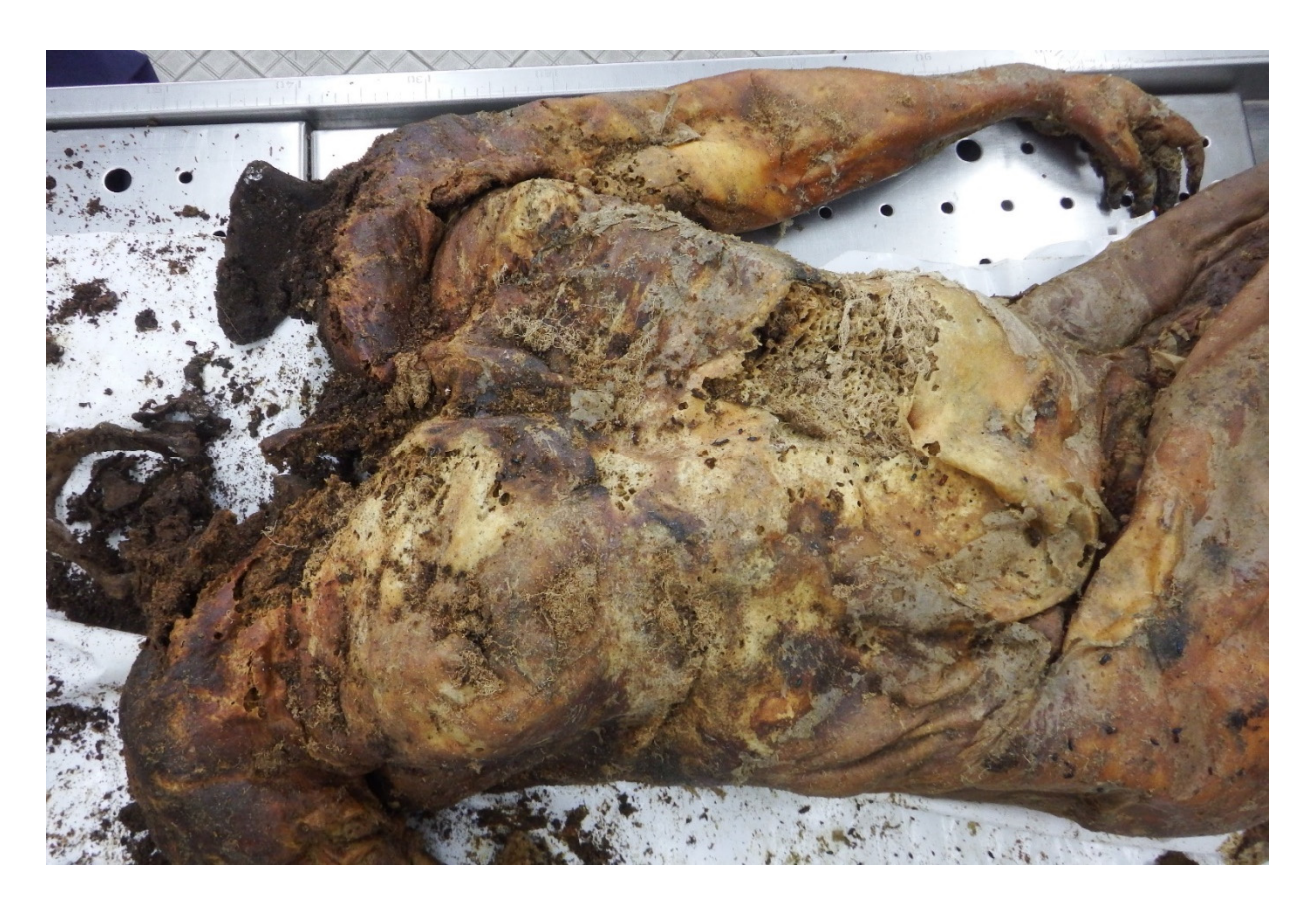
Figure 6. State of preservation of the corpse with obvious damage by Dermestes (s.str.) haemorrhoidalis (case #3).