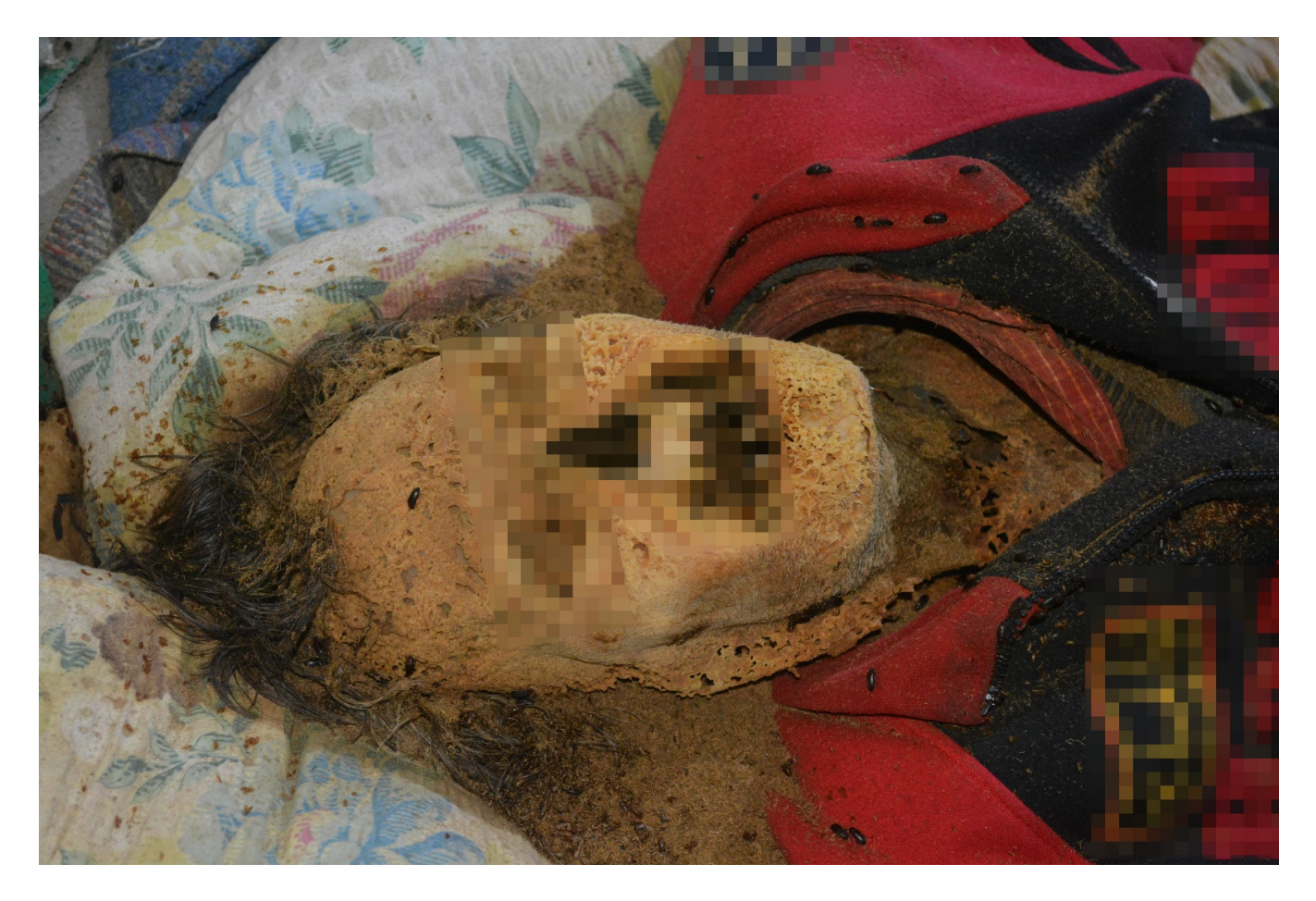
Figure 5. Feeding marks of Dermestes (s.str.) haemorrhoidalis on the head of the corpse (case #2).

Necrobia rufipes (De Geer, 1775) (Coleoptera: Cleridae) (eighty-five adults and twenty larvae) and D. ( s.str. ) haemorrhoidalis (twenty-two adults, many larval moults, and five larvae) were collected from the corpse in an autopsy room and preserved. In addition to beetles, developmental forms of the following Diptera were collected: Piophila casei (Fallén, 1813) (Diptera: Piophilidae) (one larva, twenty-six puparia, and two adults), puparia of Phoridae (probably Megaselia sp. Rondani, 1856, eleven puparia), and Chrysomya albiceps (Wiedemann, 1819) (Diptera: Calliphoridae) (numerous puparia and three dead adults). In this case, the forensic entomologist was not present at the site where the body was found.