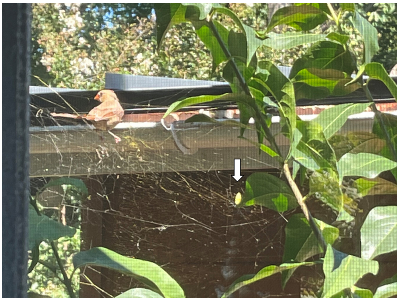
Figure 2. Kleptoparasitism behavior by a northern cardinal ( Cardinalis cardinalis ), observed on 13 September 2022 in Atlanta, GA (Fulton Co.). The cardinal perched on the top of the jorō spider web (which did not break) and proceeded to pick off trapped insects from the web. The spider (arrow) moved to the edge of the web during the encounter. The bird flew off after ~2 min, seemingly without effort or entanglement. The web remained intact and was present the following day. Photo taken by A. Schronce (through a screen door).

On 13 September 2022, the first author observed a female cardinal ( Cardinalis cardinalis , L.) perched on the top support strands of the web (the web was visible from a screen door). The author did not witness at what point it alighted, but presumably it was not long before the observation. At first, the author believed the bird had been trapped, but this turned out not to be the case. The bird was in fact perched on the web itself (not a branch or support structure), and near the middle of the web, which appeared capable of supporting the bird. The author made sure this was the case by watching closely, and also by examining the web afterward. The author was able to take photos of the perched bird through a screen door (Figure 2). The author observed the cardinal lunge toward the spider (while perched), though the spider moved away from the bird. It is unclear if this was an attempt to capture the spider or to warn it off.