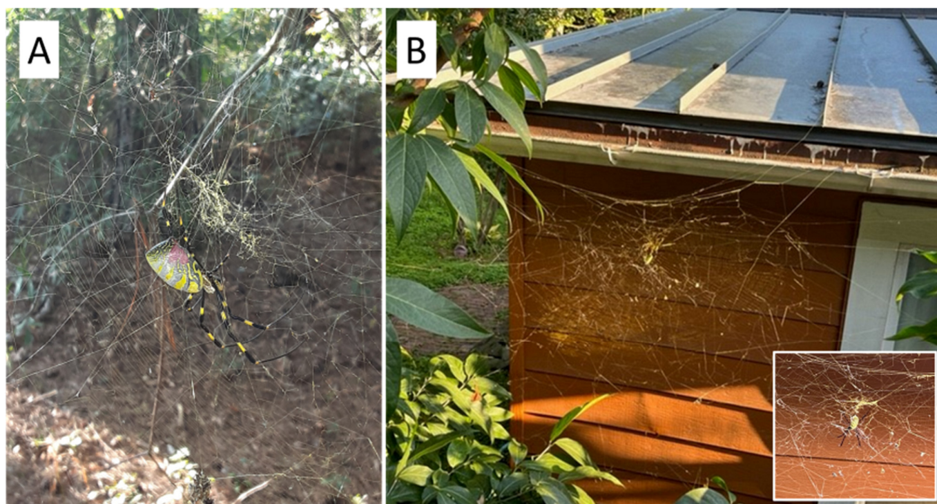
Figure 1. (A) A female jorō spider, Trichnophila clavata , in its web. Note the complex (not two-dimensional) web pattern. in Watkinsville, GA on 18 October 2020. (B) Photograph of the jorō spider web in Atlanta where the observation occurred. The web was strung between stalks of wintersweet and a neighboring structure and was approximately 1.25 m × 1.25 m in size.

Jorō spiders, Trichnophila clavata L. Koch 1878 (Figure 1A), are an orb-weaving species native to Japan and eastern Asia but have recently been introduced to the southeast United States, being first observed in 2013 in a few locations in northern Georgia [7] and are now expanding their range. They are expected to continue spreading beyond the southeast, since their physiology appears suited for surviving the colder climates of the north of the United States [8]. This spider species is large (with outstretched legs, up to 10 cm), and they have a striking color pattern of black, yellow and red (Figure 1A). Importantly, their webs are very conspicuous; they are typically up to 1 m in diameter, with a three-dimensional structure (Figure 1B). In the new United States region, these webs are often found in human-dominated landscapes, such as urban areas, and can be built on a wide range of human structures or close vegetation (Davis, pers. obs.). Additionally, of note, is that the individual web fibers are exceptionally strong; spiders in this genus are known for producing silk with high tensile strength [9–11]. The following observation also speaks to this exceptional fiber strength.