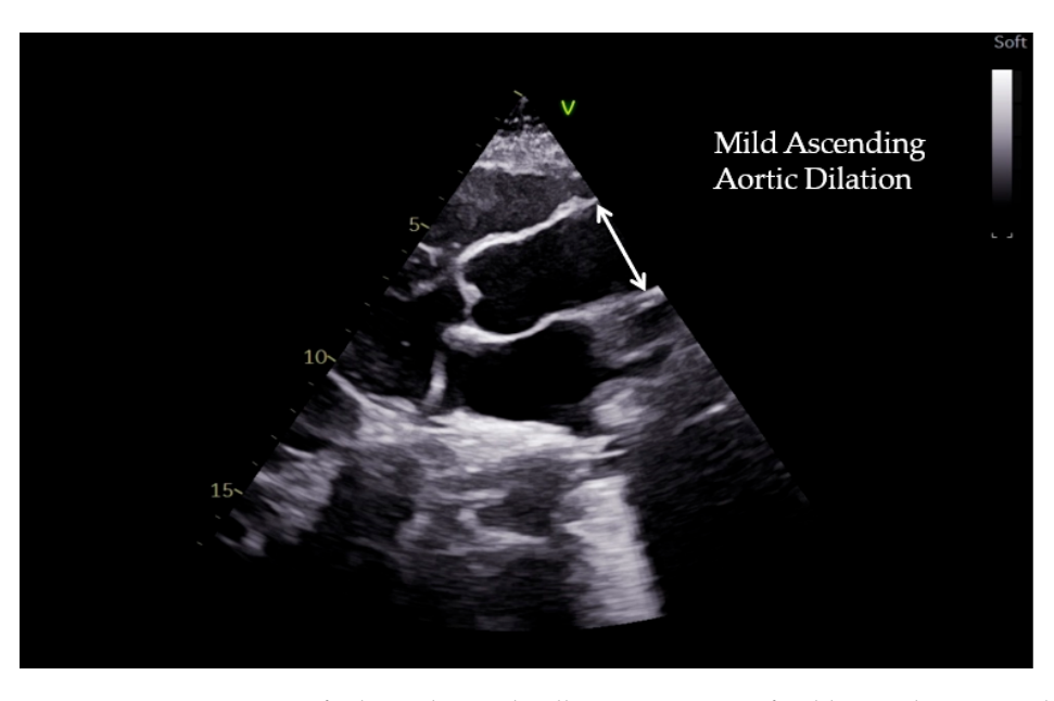
Figure 1. Long-axis view of echocardiography illustrating a case of mild ascending aortic dilation in a 11-year-old child with bicuspid aortic valve.

This anterior-to-posterior aortic wall measurement in the end-diastole, perpendicular to the aorta longitudinal axis, is obtainable using a leading-edge-to-leading-edge method (as suggested for M-mode) or an inner-diameter-to-inner-diameter method [18], as proposed from some centers aiming to establish uniform TTE measurements with other imaging modalities. However, a single 2D view may underestimate the maximum annular dimension, especially if there is an asymmetric aortic enlargement. Moreover, as it is not a straight tube, the aorta may be imaged obliquely, overestimating its true diameter [19]. Finally, many other factors may limit the quality of the windows, ultimately limiting the accuracy of aortic measurement. Transesophageal echocardiography (TOE), computed tomography (CT), and magnetic resonance imaging (MRI) may overcome these limitations thanks to their higher spatial resolution and the possibility of performing a comprehensive multiplanar analysis using a three-dimensional (3D) dataset [20]. For both CT and MRI techniques, ECG-gated acquisition is advisable for improving the accuracy and reproducibility of the aortic measurements because cardiac pulsation and aortic motion may overestimate the maximum diameter. ECG-gated CT, given its higher spatial resolution, availability, and user independency, is the most accurate method for evaluating the aorta (Figure 2).