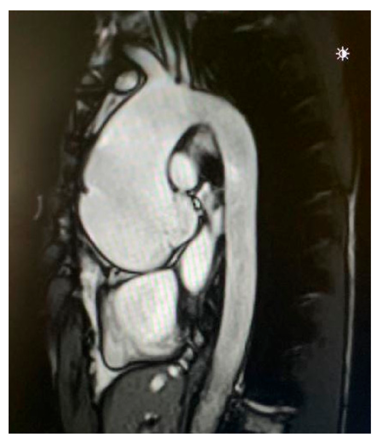
Figure 5. Cardiac magnetic resonance imaging showing a severe aortic root dilation in a patient with Marfan syndrome.

According to the current ESC guidelines [2], individuals with Marfan syndrome without aortic dilatation are classified at low-intermediate risk, and these individuals are recommended to avoid high- and very high intensity exercise, other than contact and power sports, with a preference for endurance sports. Table 2 summarizes current ESC recommendations regarding sports activity and surgery in patients with Marfan syndrome.