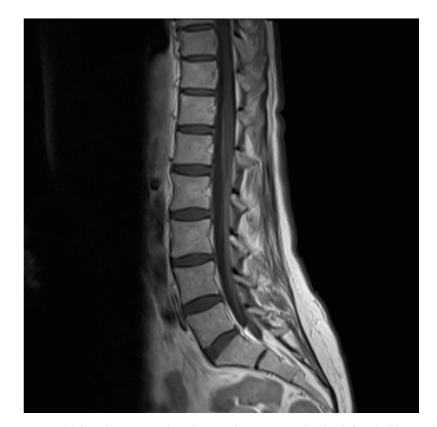
Figure 1. A 61-year-old female presented with opioid resistant radicular left-sided leg and back pains with nocturnal aggravation in July 2019. A year earlier she had been diagnosed with stage II breast cancer with lymph node metastasis. She had undergone lumpectomy with neoadjuvant chemotherapy, radiation and anti-estrogen treatment with letrozole. Initially, deep vein thrombosis was suspected; ultrasonic examination was performed, and anticoagulant therapy was initiated, as thrombosis could not be disproved. A skeletal scintigraphy conducted in the beginning of August was without evidence of bone metastases. Two weeks later the patient experienced progression of symptoms with band-shaped pain corresponding to Th8-10 and truncal dysesthesia, followed by unilateral foot drop and subsequent facial palsy, both right-sided. No cognitive deficiencies or nerve reflex abnormities were found. Under the suspicion of meningeal carcinomatosis, 150 mg prednisolone was initiated, and a magnetic resonance imaging (MRI) of the neuroaxis and a whole body <sup>18</sup>F-FDG PET/CT was requested and performed within the next 48 hours. Laboratory testing was within normal range. White blood cells were 6.8 \times 10^9 /L (normal range: 3.5-8.8 \times 10^9 /L), hemoglobin 8.7 mmol/L (normal range 7.3-9.5 mmol/L), C-reactive protein 2 mg/L (normal range: 0–10 mg/L). Additionally, alanine aminotransferase (ALT), lactate dehydrogenase (LDH), bilirubin and creatinine were normal. The patient did not recall tick-bite or erythema migrans. However, due to signs of radiculopathy and mononeuritis, cerebrospinal fluid (CSF) was tapped and examined for inflammatory and malignant cells. The analysis showed CSF pleocytosis with 106 cells per \mu L (77% monocytes) and an elevated protein level of 1.14 g/L. CSF culture and polymerase chain reaction (PCR) for bacterial DNA in CSF were negative as well as PCR for herpes simplex virus, varicella zoster virus, enterovirus and cytomegalovirus. No malignant cells were detected in CSF, and flow cytometry was normal. The subsequent MRI showed a strong contrast enhancement of the conus medullaris.