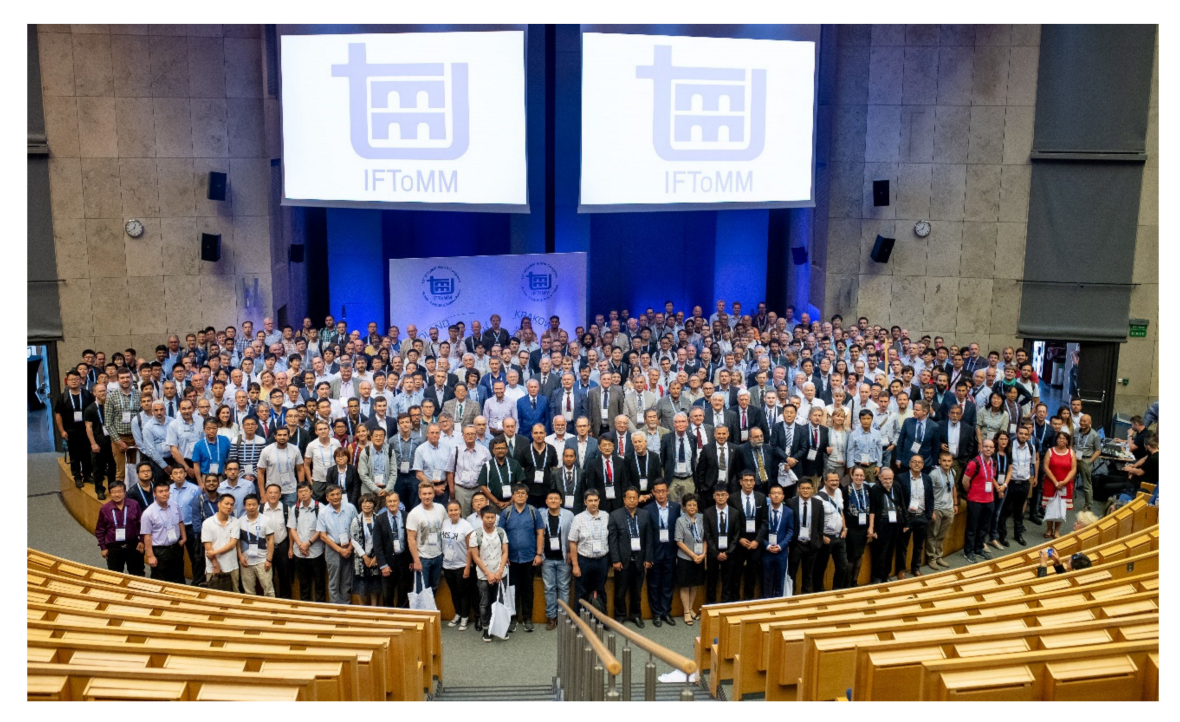
Figure 7. Group photo of the attendees at the celebration of the IFToMM 50-year anniversary.

The celebration finished with a wine toast in a familiar frame and will live in the memory of all attendees through the specially designed celebratory congress gift to the attendees, Figure 8.