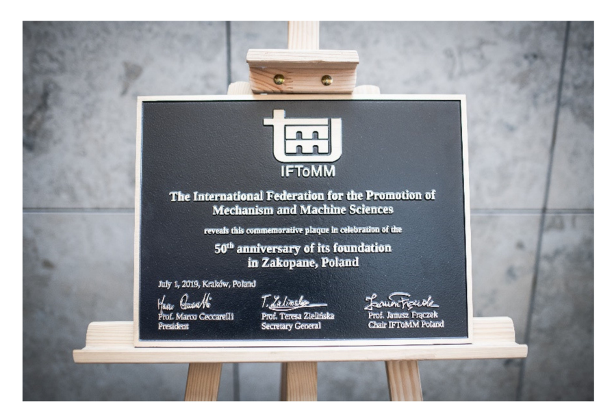
Figure 1. The bronze commemorative plaque for the 50-year anniversary of IFToMM.

In the 15th World Congress, 637 participants from 66 countries and regions registered 437 papers presented in a dense program with 17 topic sections in the wide domain of MMS and those most relevant to the IFToMM Technical Committees. The Springer Nature in Series Mechanism and Machine Science published proceedings of the 15th World Congress proceedings in five volumes [1].