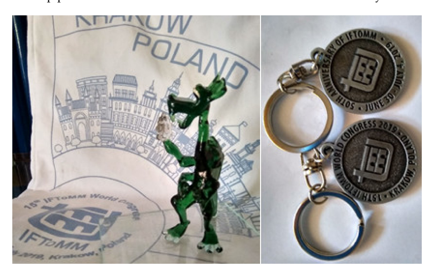
Figure 8. Gifts at the 2019 IFToMM World Congress as memories of the IFToMM anniversary.

Conflicts of Interest: The authors declare no conflict of interest.