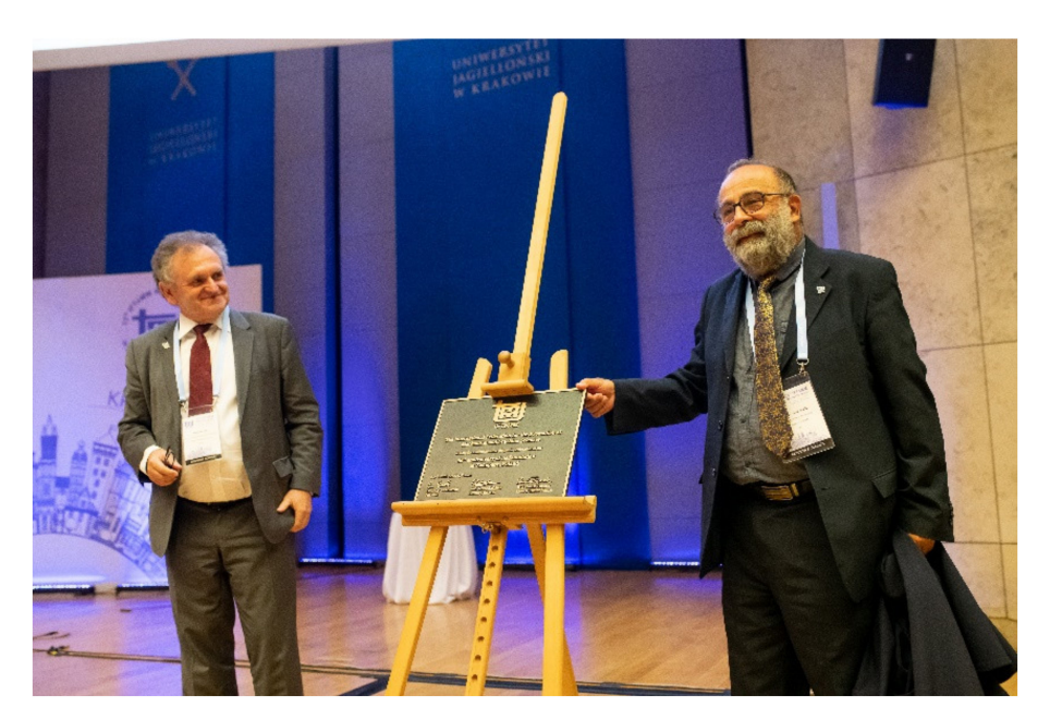
Figure 4. The revealing act of the bronze commemorative plaque.

At the end of the celebration session the current IFToMM President, Marco Ceccarelli, and the chair of the 2019 World Congress, Tadeusz Uhl, revealed the commemorative plaque, Figure 4, among the enthusiastic applause of the congress attendees.