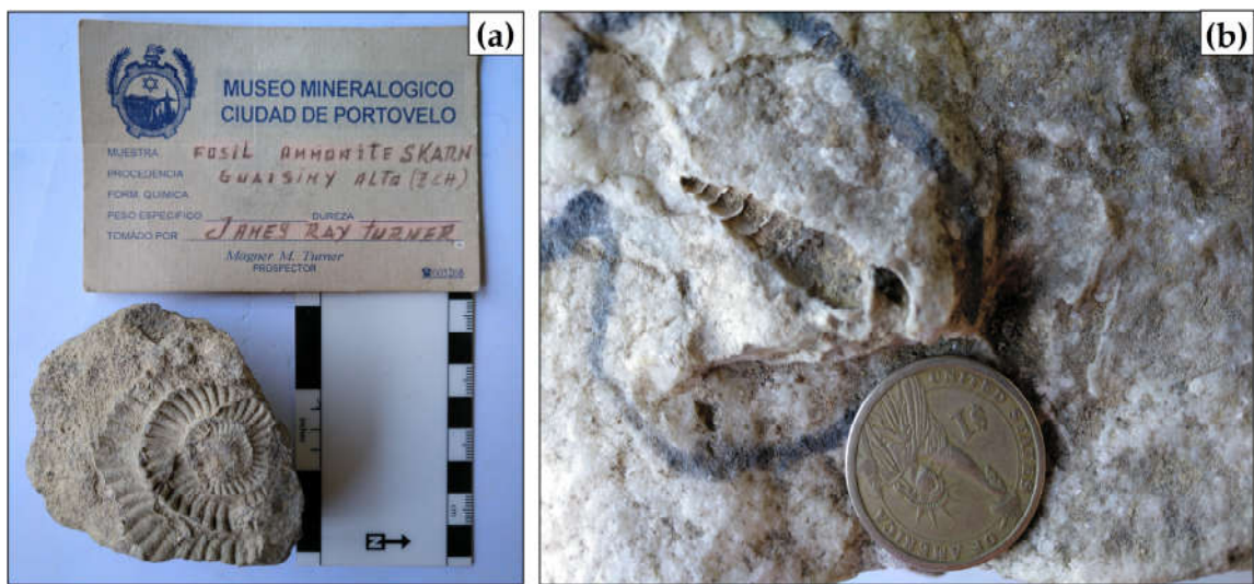
Figure S3. Paleontological units: (a) ammonite and (b) gastropod footprint.