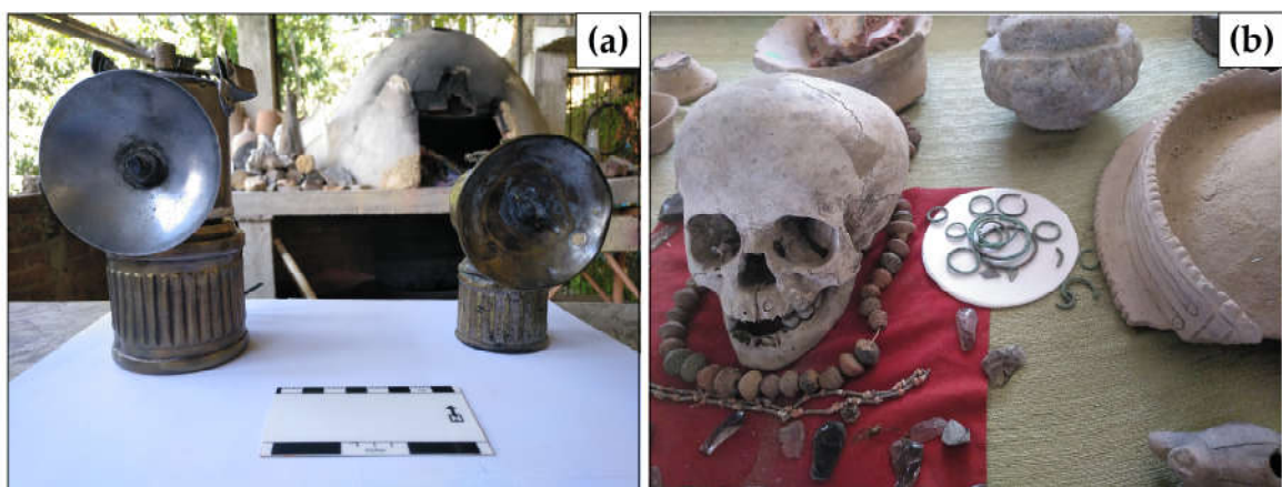
Figure S4. (a) Artisanal mining equipment and (b) Archaeological pieces.