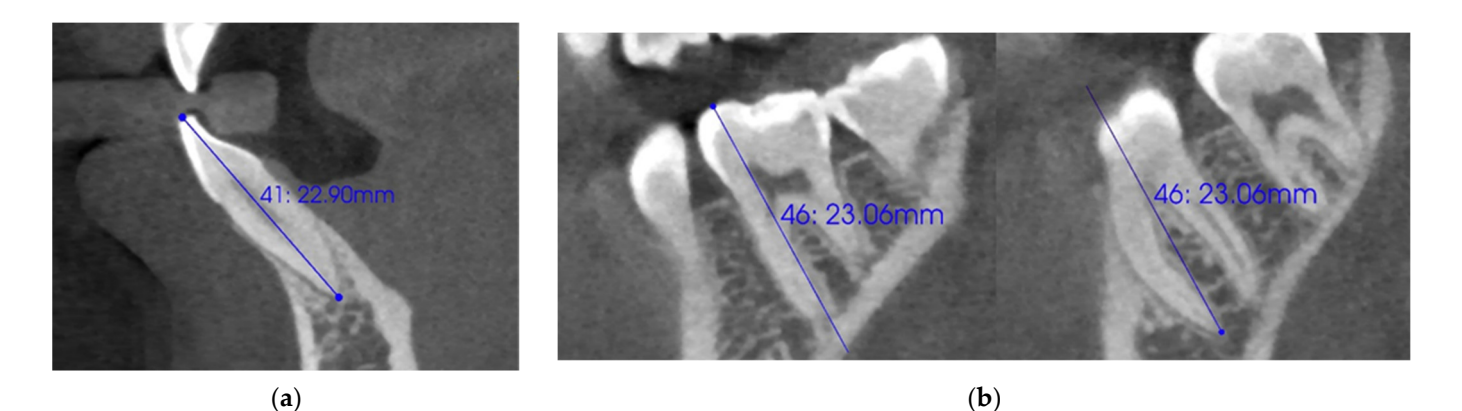
Figure 1. Example measurements of the length: ( a ) of a single-rooted tooth using a single section; ( b ) of a multi-rooted tooth using more than one section.