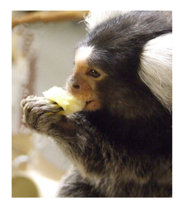
Figure 1. A common marmoset using its right hand to hold a piece of food to its mouth.