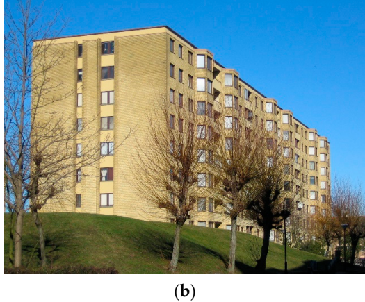
Figure 1. (a) Dense urban landscape, with floor, walls and open roof. The public space is in shadow. (b) Open urban landscape with vegetation as transparent curtains. Wandering light/shadow in the public space.

Constant shadow on the ground and in other buildings affect not only bodily experiences of warmth and chilliness, dryness and moisture (basic living conditions for all flora and fauna), but