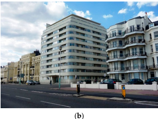
Figure 2. (a) Example of commercial bottom floors, encouraging mobility, encountersand commerce. (b) Example of residential bottom floors, creating anonymous, empty surroundings (Photos: PDM).

A third example of the consequences of the relationships between house and the ground is how public offices or service functions are designed and structured (Figure 3).