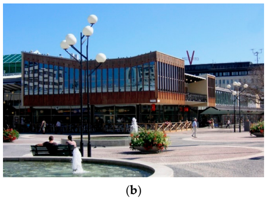
Figure 3. (a) House built for a bank in the 1890s, with a solid, almost repelling front. (b) Community center from 1950s, with public space, shops and bank services.

Each of these characteristics (as well as other qualities) should be problematized and contextualized in an urban development situation; how does a change in density change the relationships between buildings and ground, how does it change mobility options and land use and how do the effects together change the landscape, perceived from the site?