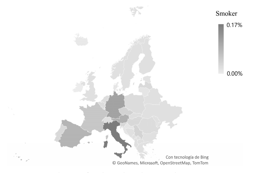
Figure 1. Distribution of traditional combustion tobacco consumers in Europe.

in adults, such as France and Germany. The simple differentiation between high- and low-income countries does not seem enough to explain the final results. Within-country income level disparities play an important role, too. These disparities highlight some of the complex interplays between economic factors and tobacco consumption behaviors Figure 1.