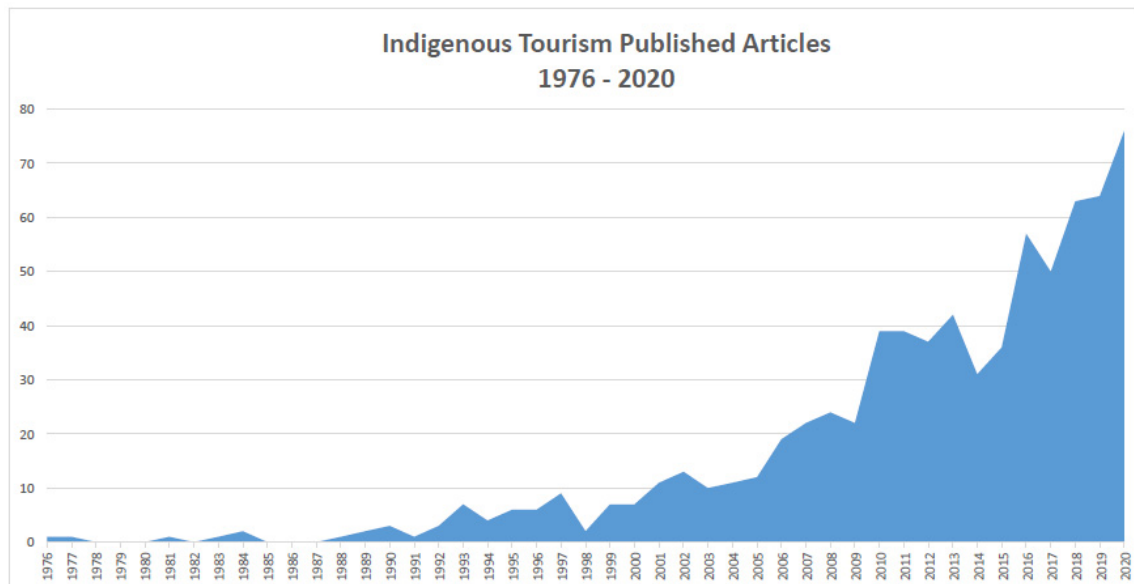
Figure 1. Growth in publications on tourism and indigenous peoples.

research dealing with what might be described as non-traditional Indigenous forms of economic development related to tourism in the tourism literature, despite featuring in other literature.