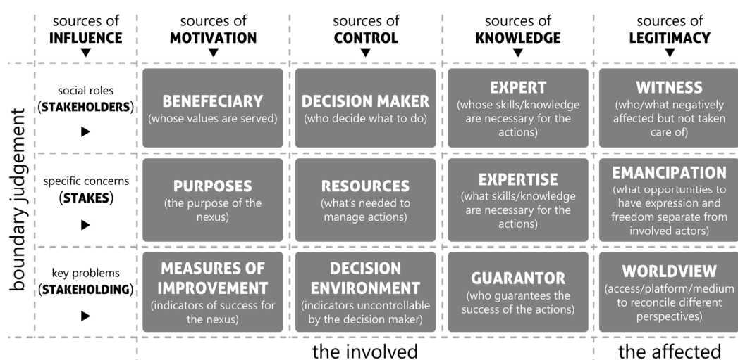
Figure 1. Theoretical framework.

ination should aim at discovering the multi-actor nexus “as is” and not what it “should be”. It necessitates a more realistic, descriptive analysis of who the actors “are” rather than an ideal, normative examination of who they “must be” in the made-up minds of observers. Considering multi-actor systems as organically formed, this study sees that it is important to apply a heuristic analysis. The theoretical framework (Figure 1) depicts the entire boundary judgment for the heuristics analysis as the product of intersections between the sources of influences (social roles, specific concerns, and key problems) and other boundary issues, which produce 12 boundary categories reflecting the total influences the actors wield toward the nexus. It produces a systematic way of mapping relationships between stakeholders, the issues with which they are independently concerned, and the key problems that they need to resolve. Applying a heuristic systems analysis based on the extensive boundary judgment allows for this study to identify key stakeholders and their relative positions, assess potential conflicts and synergies among them, and evaluate the distribution of power and influence in the systems.