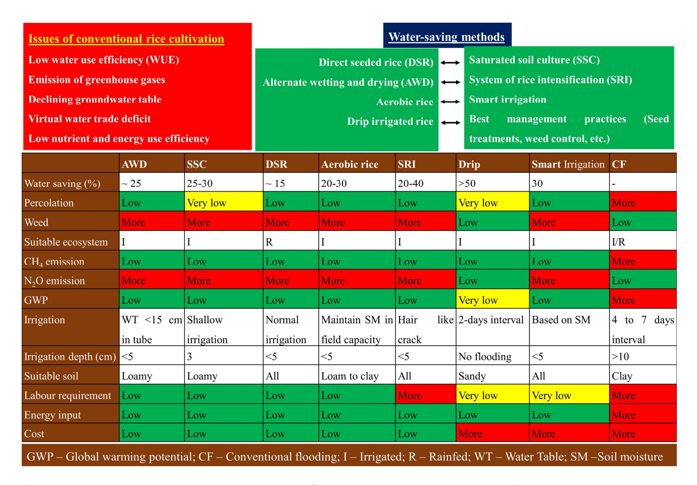
Figure 5. A comparison of water-saving rice production methods.

Soil type: Aerobic rice is most suitable for well-drained soils, while heavy clay soils are not recommended. DSR, on the other hand, is not recommended for soils with high water tables, high soil pH, or salinity, as all of these factors can lead to poor seed germination. The SRI is not suitable for poorly drained or waterlogged soils as it can result in poor tiller and root development and higher seedling mortality. Similarly, drip irrigation may not be ideal for soils with high clay content as it can lead to clogging of the emitters. However, IoT-based automated irrigation can be implemented in any soil type as long as the sensors and monitoring equipment can be installed and function properly. GHG emissions: The implementation of practices that reduce water and fertilizer inputs while promoting soil aeration can significantly reduce methane emissions associated with rice cultivation. However, these practices increase nitrous oxide emissions, as alternate wetting and drying irrigation cycles promote the conversion of ammonia to nitrate. Similarly, the adoption of energy-intensive drip irrigation equipment may lead to an increase in GHG emissions during production and operation. This is also true for IoT-based automated irrigation systems.