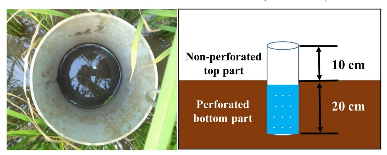
Figure 1. Perforated plastic field tube to examine the below-ground water table in AWD.

The AWD irrigation method can reduce water usage by up to 37% without affecting production. AWD has shown 23% less water use compared to continually flooded rice systems [16]. In addition to saving water, the AWD system has the potential to improve grain quality by lowering total arsenic (As) and mercury (Hg) content in rice grains by 50%, reducing greenhouse gas (GHG) emissions by 45–90%, boosting water efficiency, and keeping or even increasing grain output [17]. In rice cultivation, intermittent watering with AWD was found to decrease insect pests by 92% and diseases by 100% [11]. Additionally, the study by Duttarganvi et al. (2016) showed that the use of AWD in conjunction with cono-weeding resulted in significantly higher yields compared to other irrigation and weed