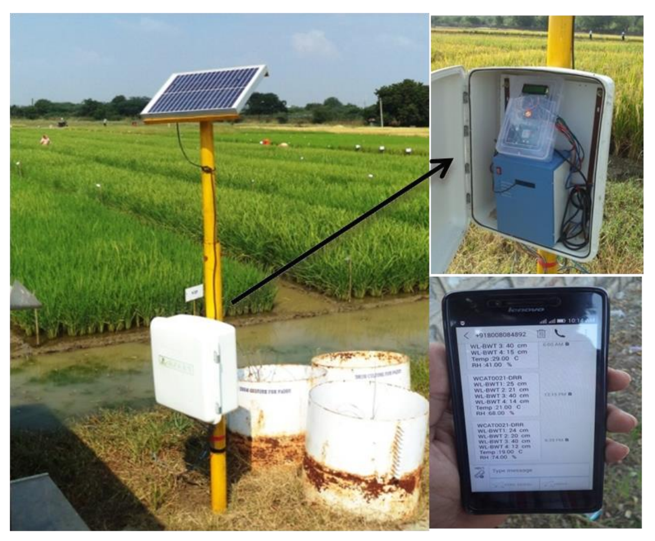
Figure 4. A smart irrigation device installed in the field.

notifications on soil moisture to the farmer's cell phone. As a result, the farmer may control the water supply using SMS (Figure 4).