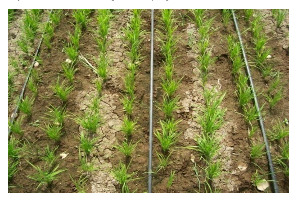
Figure 3. Rice cultivation through drip irrigation.

rice [94]. In addition to saving 50–61 percent more water than the flood system, the drip system with fertigation also boosted yield and water productivity [95]. The effect of drip irrigation on WUE and water productivity is presented in Table 6.