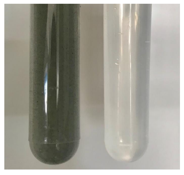
Figure S2. Digital pictures of the influent (left) and the effluent (right).