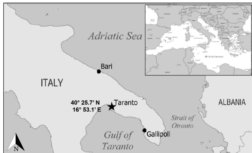
Figure 1. Map of the sampling location indicated with a star (Ginosà Marina, Gulf of Taranto, Ionian Sea) in the Mediterranean Sea.

A total of 21 healthy, adult medusae of Rhizostoma pulmo (Macri 1778) were collected at shallow depths (1–3 m depths) along the coastal waters of Ginosà Marina (Gulf of Taranto, Ionian Sea; Figure 1) from summer 2016 to winter 2017 (T1 = August 2016; T2 = September 2016; T3 = October 2016; T4 = November 2016; T5 = March 2017; T6 = June 2017; T7 = December 2017).