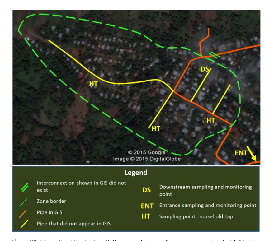
Figure S3: Schematic of Study Zone 3. Pressure and entrance flow were measured at the ENT location, approximately 1 km to the southeast of the bottom right corner of the diagram. Water quality grab samples were collected and chlorine, turbidity and pressure were monitored continuously at the pump station discharge, located approximately 400 m to the south (upstream) of ENT.