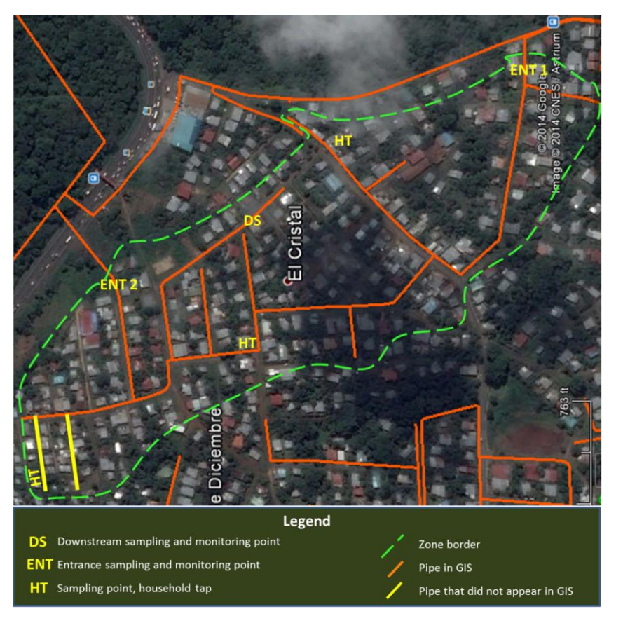
Figure S2: Schematic of Study Zone 1.