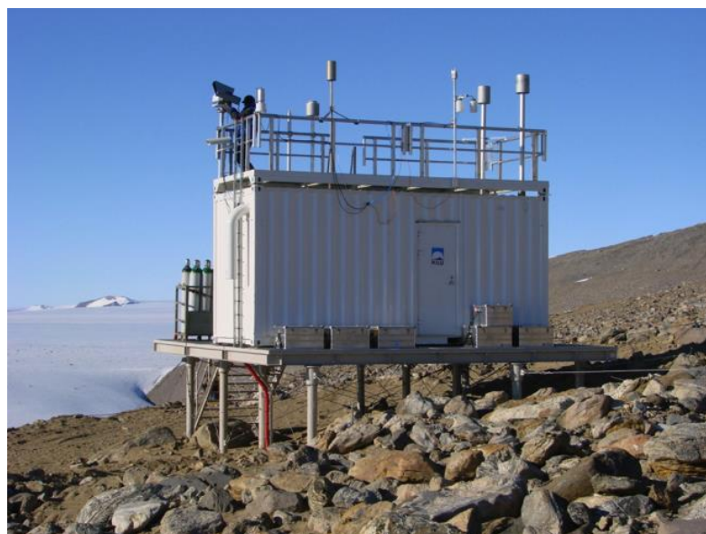
Figure S1. Trollhaugen atmospheric monitoring observatory.

* Correspondence: s.bengtsonnash@griffith.edu.au