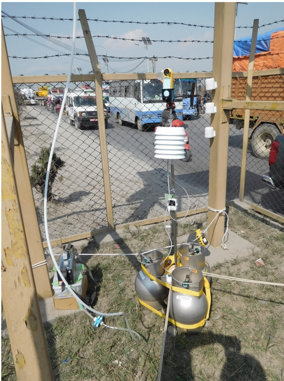
Figure S2. Sampling at Koteswor site.