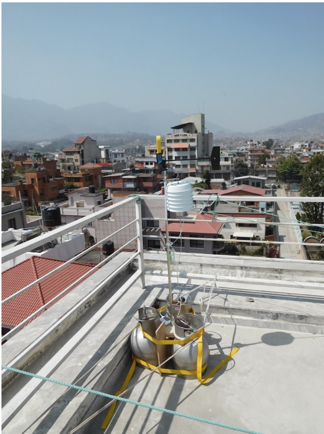
Figure S3. Sampling at Sanepa site.