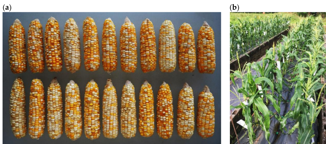
Figure 1. (a) The ears of the F 2 population used for development of sweet corn inbred lines and (b) plants of some sweet corn genotypes in crossing nursery.