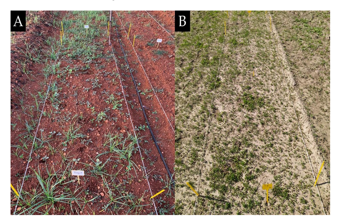
Figure 1. Control plots at the beginning of the experiments at: ( A ) Guadassuar (GUA); ( B ) the Polytechnic University of Valencia (UPV).

Table 2. List of treatments tested, with their acronyms and application rates.