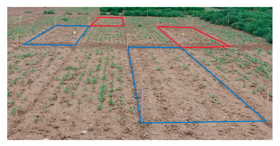
Figure 3. Exp. 2 (25 DAE): phytotoxic effects of metazachlor (plots delimited in red) and metribuzin (plots delimited in blue) in the plots of two blocks. Herbicide phytotoxicity included reduction in crop stand and in crop growth.