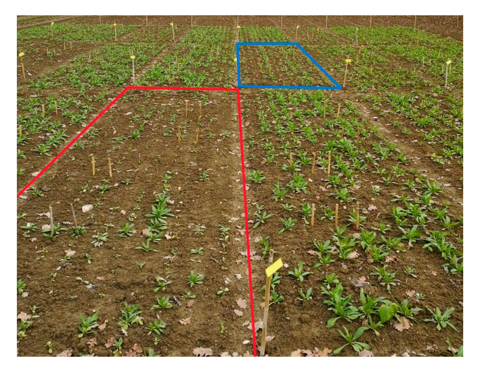
Figure 2. Exp. 1 (45 DAE): phytotoxic effects of metazachlor (plot delimited in red) and metribuzin (plot delimited in blue) in the plots of a block. Phytotoxic symptoms were due to a reduction in plant growth, without effects on plant emergence (looking carefully, in plot delimited in red, the plants were very small but were emerged).

In each column values followed by the same letter are not significantly different according to the Fisher's protected LSD test (p = 0.05); n.s.= non significance