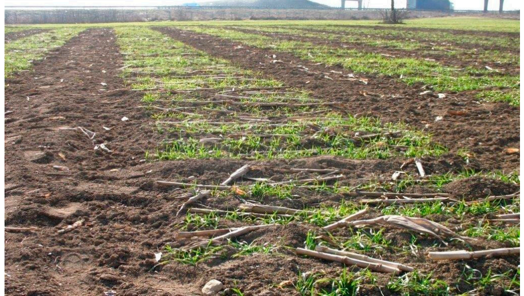
Figure 1. Maize stalk residue deployed in the field at the location of Botinec in 2011.

were sprayed using a backpack-carried manual sprayer early in the morning, and 40 mL of inoculum was applied to each plot in both sprays. The second method of inoculation was conducted using infected maize stalks collected in an infected maize field from a maize inbred line susceptible to F. graminearum . The stalks were cut into 20–30 cm long pieces and scattered on the soil surface (15–20 pieces per experimental plot) in late autumn when the first two leaves emerged on plants (Figure 1). The third type of infection occurred under natural conditions, i.e., no artificial inoculation was performed. In this study, no mist irrigation was applied for either artificial inoculation or natural infection.