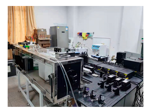
Figure 2. Material composition three-dimensional platform.

The application of chlorophyll fluorescence detection technology in the field of seed viability detection has also received attention in recent years. Anhui Institute of Optics and Fine Mechanics, CAS, has studied fluorescence detection techniques for years and developed a system of material composition three-dimensional platform. It has been used in digital agriculture research (Figure 2).