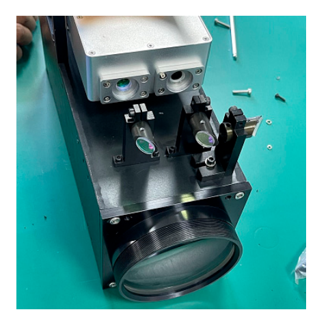
Figure 3. A handhold Raman Spectroscopy detection device.

As Raman spectroscopy shows great potential for rapid analysis, its related work in the field of general agricultural detection is also developing rapidly. More typically, Ambrose et al. used a Raman spectrometer ( 1700-3200 \text{ cm}^{-1} ) to identify viable and inactive corn seeds [33], with an accuracy rate above 93%. The analysis of existing research reports also found that the Raman scattering signal is weak, which plagues its application in the field of seed viability detection, and related problems still need breakthroughs in key devices.