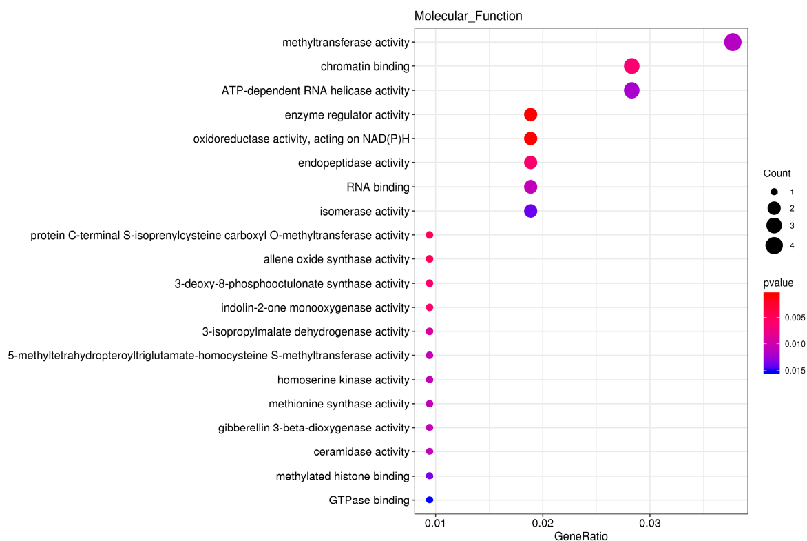
Figure S3. GO enrichment of 171 genes in the integrated QTL regions-Molecular Function.