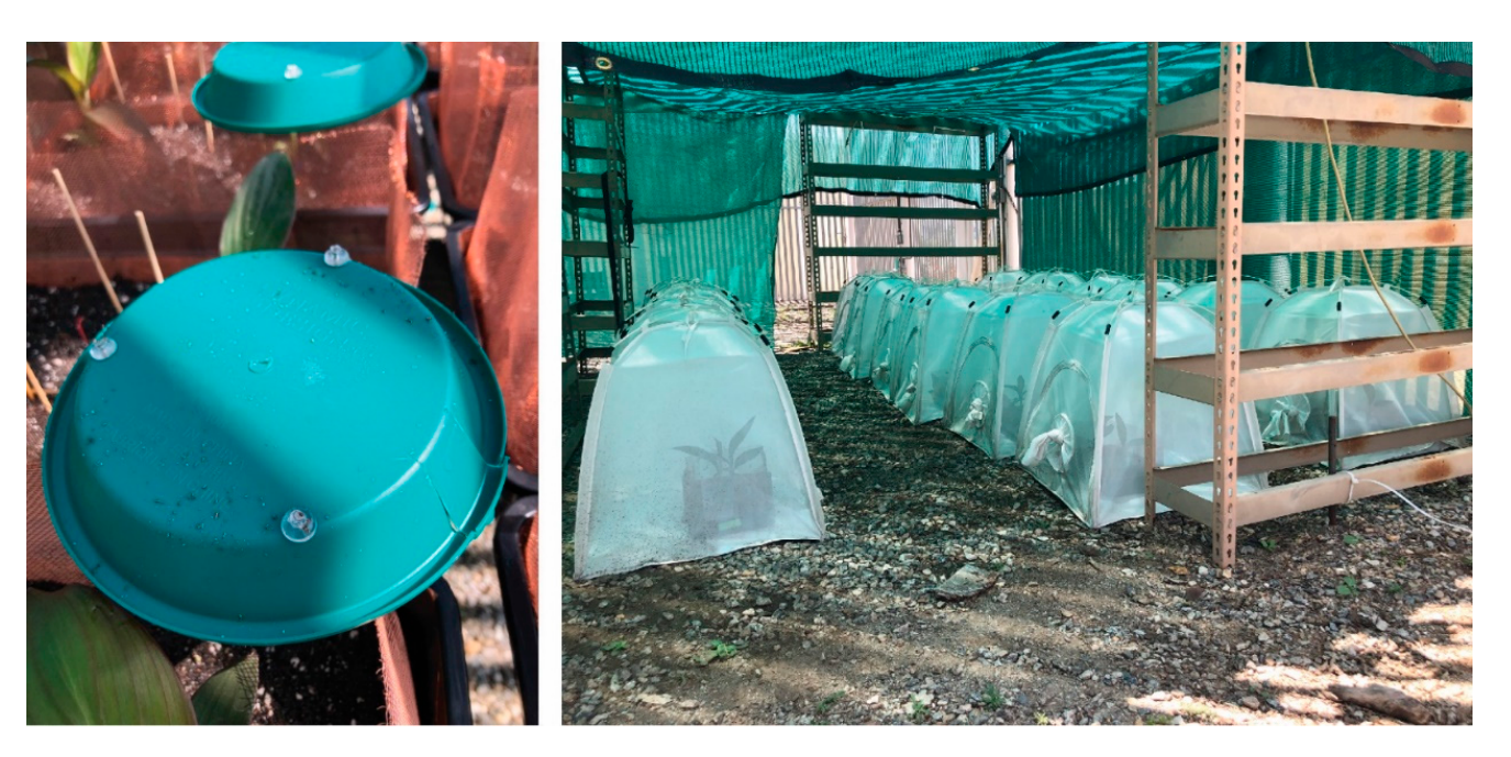
Figure 1. Potholders on pin stilts ( left ) which functioned as slug shelters between Canna 'Cannova<sup>®</sup> Bronze Scarlet Canna Lily'. The arenas were used to determine the mortality of Deroceras reticulatum exposed to three Phasmarhabditis species. The arrangement of bug dorms with arenas inside the lath house ( right ).

A five-fold increase (150 ljs/cm<sup>2</sup>) of the recommended rate of Nemaslug<sup>®</sup> was used for each nematode treatment due to space, logistical limitations, and the fact that this was our first field experiment utilizing all three species of local Phasmarhabditis strains. The higher recommended rate of Sluggo Plus<sup>®</sup> (4.88 kg/m<sup>2</sup>) was used to compare with the nematode treatment efficiencies. We provided two controls, one with slugs and no nematodes, and the other with no slugs or nematodes.