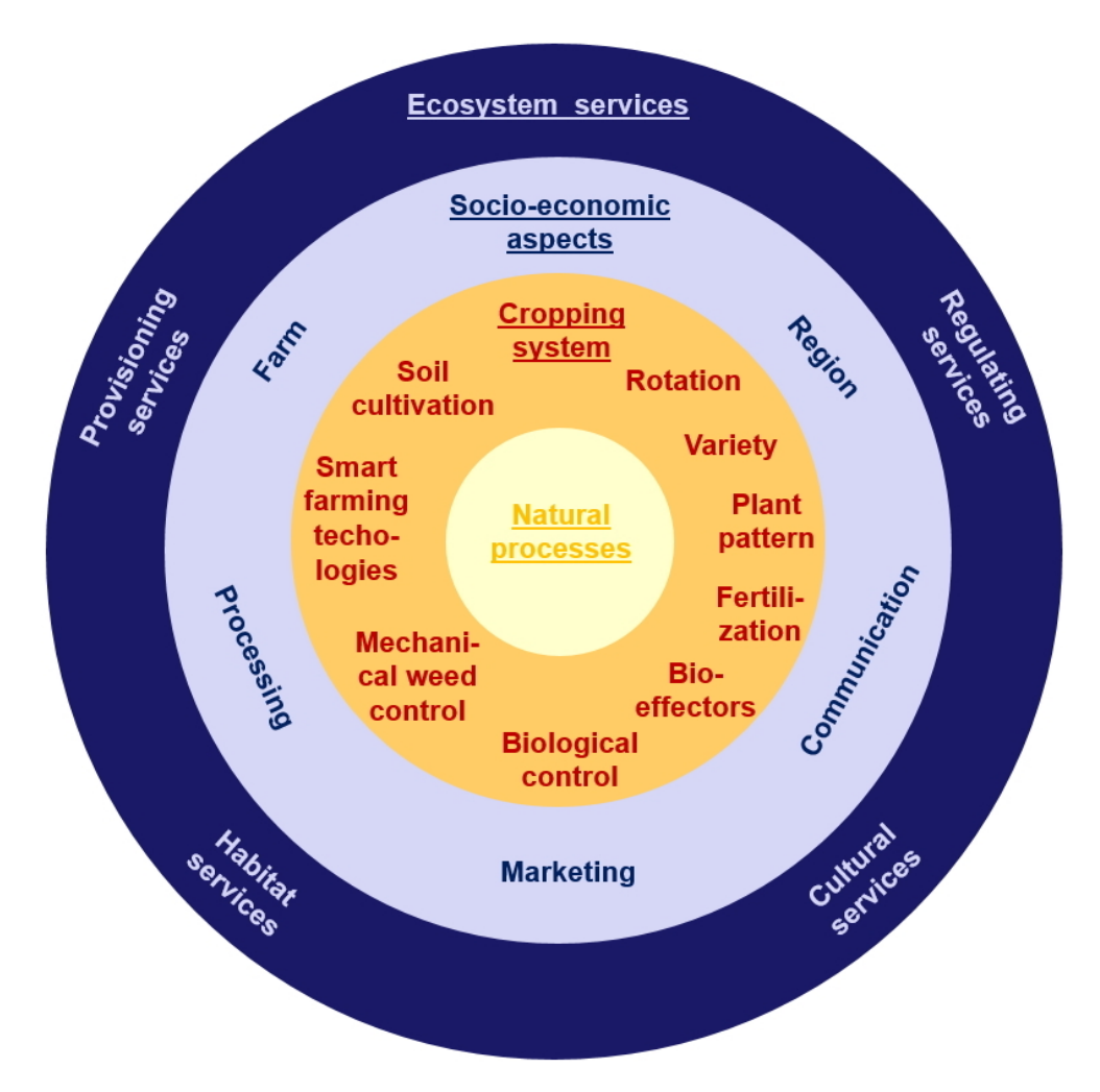
Figure 3. Schematic representation of essential levels and aspects to be considered in the development, implementation, and evaluation of mineral-ecological cropping systems.