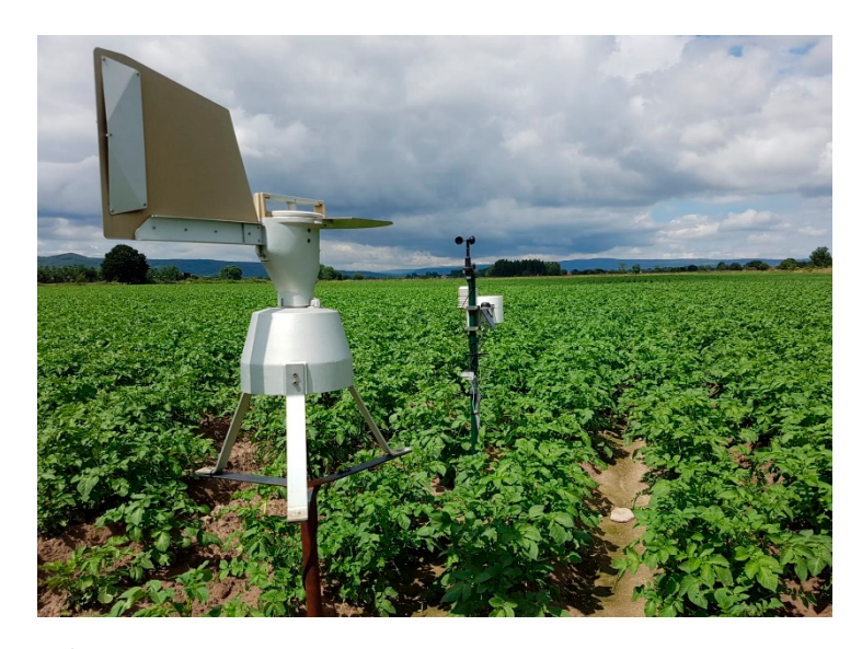
Figure 1. iMETOS ® 3.3. by Pessl Instruments weather station and Lanzoni VPSS 2000 volumetric sampler.

Alternaria conidia counted using an Eclipse E200 optical microscope (Nikon YS100, Nikon Instruments Inc., New York, NY, USA) equipped with a 40X/0.65 lens, following the methodology proposed by the Spanish Aerobiological Network (R.E.A) [40]. Concretely, A. solani and A. alternata are the most relevant in the study area, and these species based on their conidia morphology were identified. Finally, the results were expressed as the number of spores per cubic meter of air.