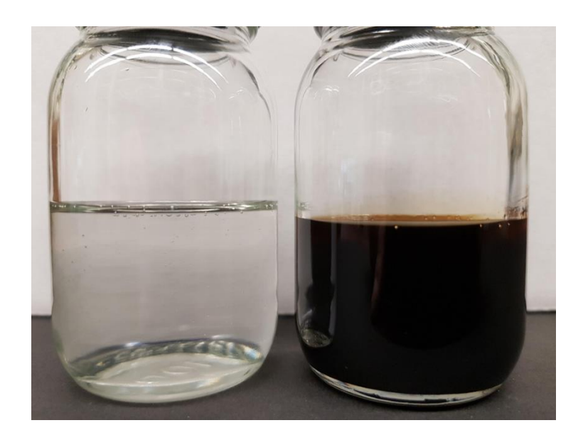
Figure 1S. Glycolysis product obtained from flexible PU foam waste and diethylene glycol at 1:1 (w/w) ratio, in autoclave (image at right), compared to the virgin polyol (image at left)